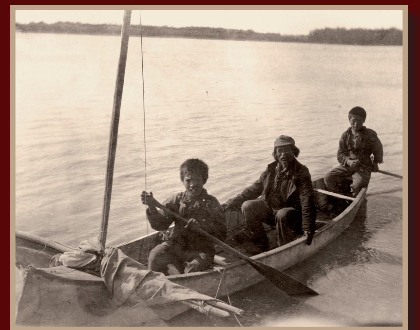
Chandler River Indians at Fort Yukon. Yukon Flats District, Alaska, 1909.