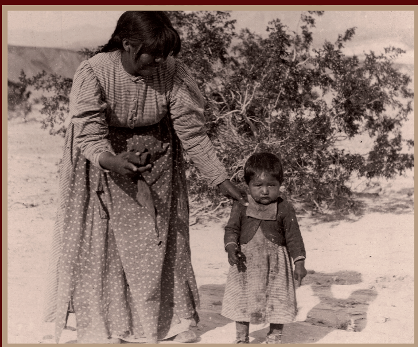
Indians at Greenland Ranch, Death Valley, California, 1901.