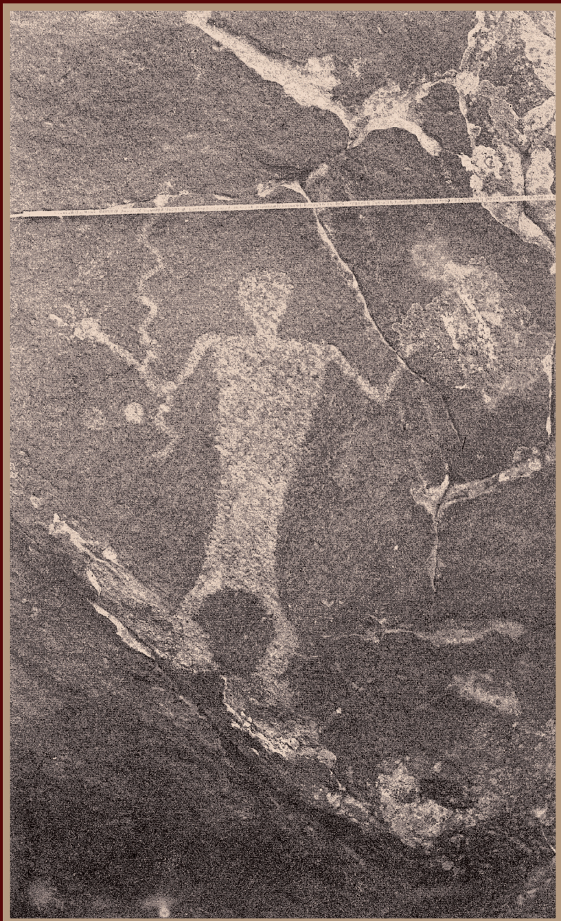
Indian pictograph on Dakota sandstone cliff in Apishapa Canyon below mouth of South Canyon, made by chipping the "desert varnish" from the weathered surface of the rock. Las Animas County, Colorado, 1912.

Seven Generations of American Indian and U.S. Geological Survey Relationships