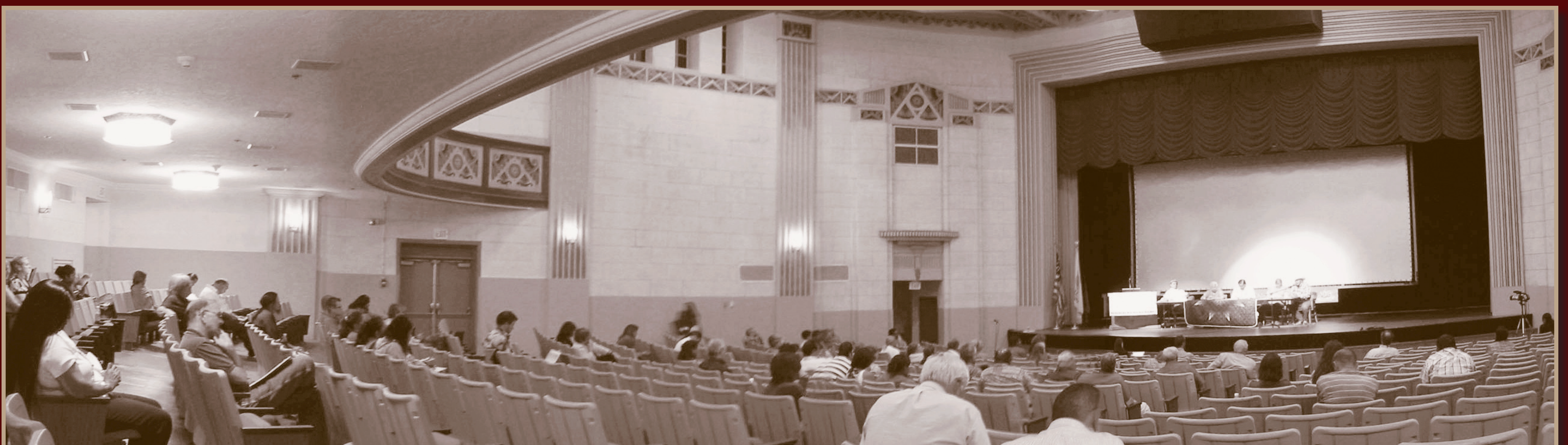
Seventh Annual Tribal College Forum: USGS in concert with NativeView, Inc. has hosted seven annual Tribal College Forums (TCF) to promote the value of science in Tribal Education. TCF VII was held at Haskell Indian Nations University, Lawrence, KS, 2008.