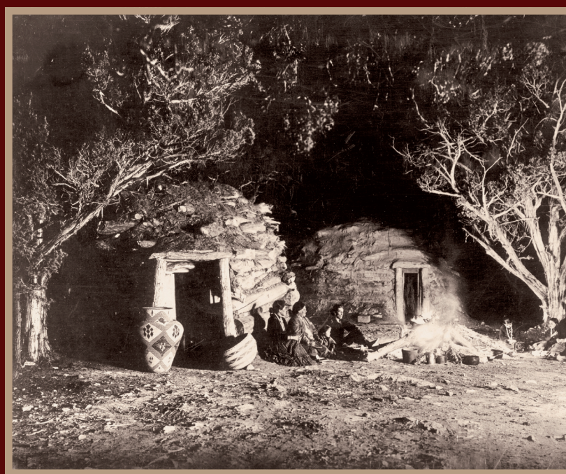
An evening with Navajo Indians about the camp fire, north-central Arizona, 1905.