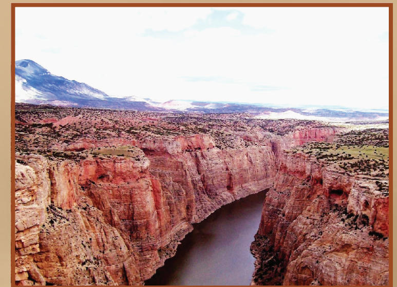
lisaxpuatahcheexakupe: Bighorn Canyon, Mont., of significance to the Apsaalooke (Crow).

The soil you see is not ordinary soil – it is the dust of the blood and flesh and bones of our ancestors. We fought and bled and died