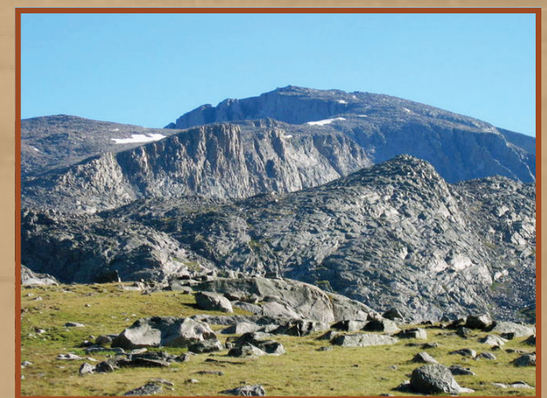
Awaxaawakússawishe: “Extended Mountain”: Cloud Peak, Wyo., the center of the Apsaalooke (Crow) world.