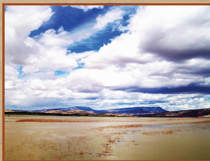
lisaxpuatahcheeaashisee: Bighorn River, Mont., central to Apsaalooke (Crow) beliefs and history.