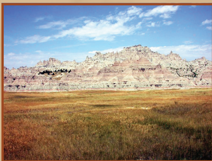
Tokala Ta Onakinjin: “The Stronghold”: The Badlands, S. Dak., important to Oglala Lakota history.