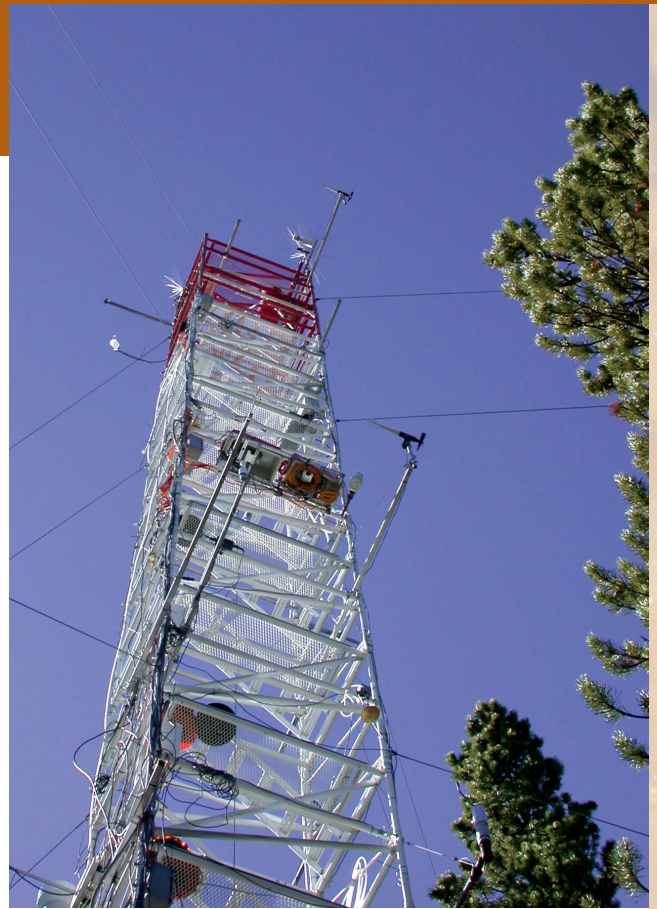
Instruments for measuring exchange of carbon dioxide and water between a forest and the atmosphere. (Niwot Ridge Long Term Ecological Research Site,)