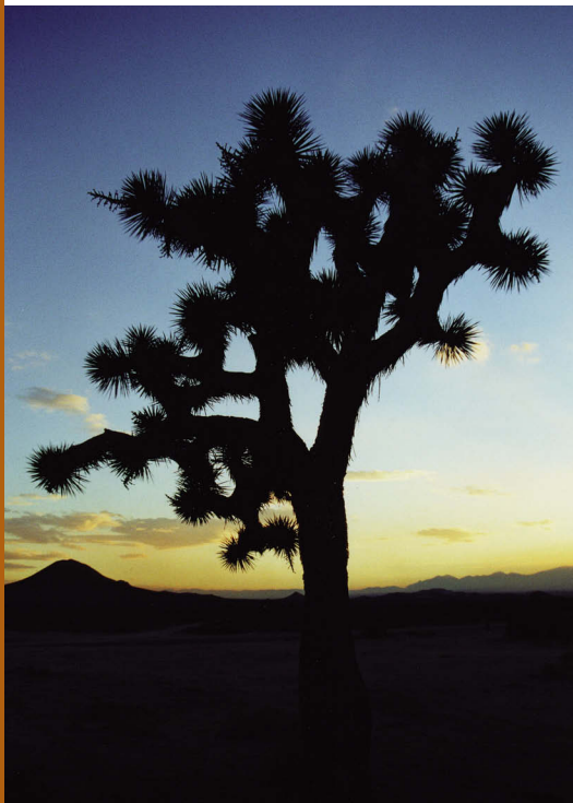
Joshua tree.