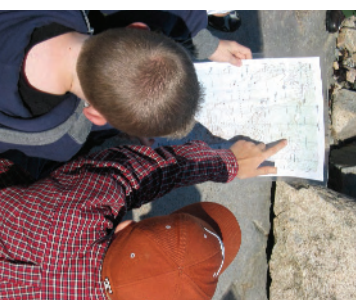
Communicating through mapping and graphing is one of the SEA Program's unifying themes.