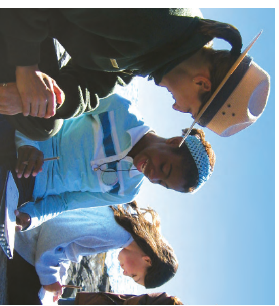
Curriculum-based programming is aligned with Maine State Learning Results.