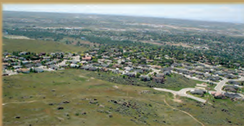
Left — Urban sprawl in Boise, Idaho. Below — Irrigation allows cultivation of hay in the high desert of Central Oregon.