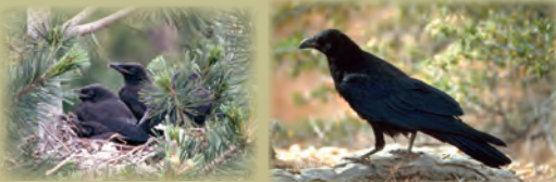
Far left — American crows Left — common raven