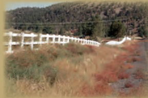
Figure 2 Anthropogenic factors that act as dispersal agents for invasive plants. The final model will depict exotic plant invasion risk across landscapes in the western United States.