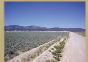
Above and left — invasive plants trailing along roads.