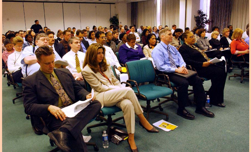
DFO staff listening to presenters at the UFMS Townhall Gathering.