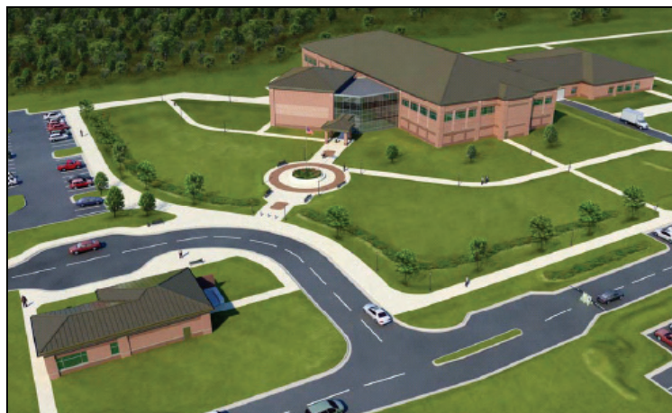
The facility, scheduled to be completed in 2010, will consist of three explosive ranges, eight classrooms, a laboratory, a conference facility, and office space for ATF personnel and federal, state, local and international law enforcement and explosives partners.

"The Department of Justice is extremely proud of ATF's expertise in the area of explosives. Through this facility, the Bureau will not only add to that expertise, but it will also share its knowledge with law enforcement partners throughout the country and the world. The research and instruction that will take place here are absolutely vital to protecting the American people, as well as America's allies," said Deputy Attorney General Filip.