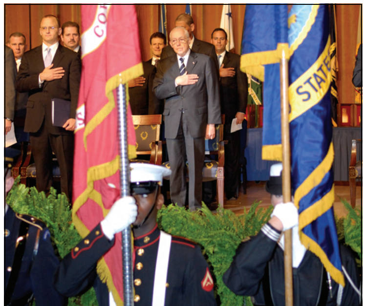
Attorney General Mukasey salutes the flag during the presentation of colors and national anthem at the 56th Annual Attorney General Awards Ceremony at Constitution Hall in Washington, D.C.

For a full list of winners, please visit http://www.usdoj.gov/opa/pr/2008/October/08-opa-954.html .