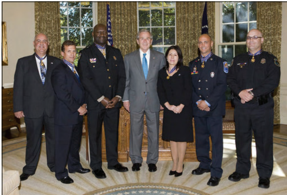
President Bush poses for a photo with the recipients of the Public Safety Officer Medal of Valor on October 22, 2008, in the Oval Office at the White House. The event was followed by a ceremony at the Justice Department.

On October 22, 2008, Attorney General Mukasey honored the nation's Public Safety Officer Medal of Valor recipients during a special ceremony at the Department of Justice. Earlier that day, President Bush presented the Medals of Valor during a White House ceremony in the Oval Office.