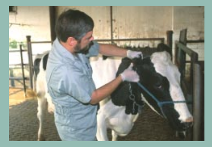
VS supports the livestock industry in the prevention and control of animal diseases that could otherwise be devastating.