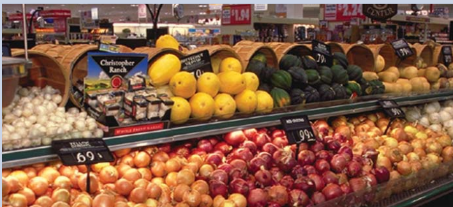
Ken Hammond, USDA

and low-fat milk and milk products. These food choices are at odds with dietary advice about the centrality of fruit, vegetables, whole grains, and low-fat dairy in healthy diets: almost half of the expenditure outlined in the Thrifty Food Plan is for fruit and vegetables.