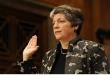
Secretary Napolitano being sworn into office

On January 21, 2009, Janet Napolitano was sworn in as the third United States Secretary of Homeland Security. Prior to her appointment, Secretary Napolitano was the Governor of Arizona and supported several DHS initiatives, including Citizen Corps. In May 2004, she signed an executive order establishing the Arizona State Citizen Corps Council. The Council was charged with developing a comprehensive, statewide plan that would support local Citizen Corps Councils across the state, and serve as Arizona's liaison to national and state organizations supporting community preparedness. Secretary Napolitano also supported Citizen Corps and community preparedness efforts through several state-wide public service announcements and by declaring September as National Preparedness Month in Arizona.