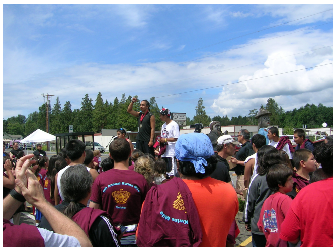
Community Participation-Lummi Kwina Mile 2007