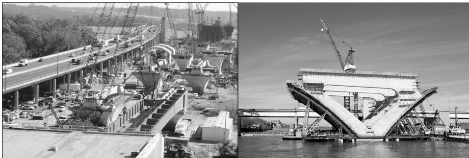
Figure 2: The Woodrow Wilson Bridge Project