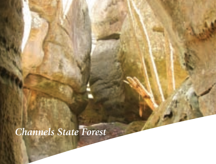
Channels State Forest