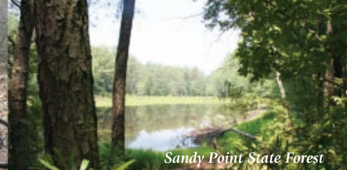
Sandy Point State Forest