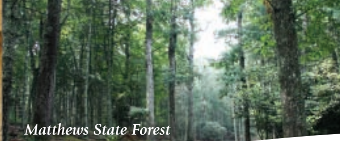
Matthews State Forest