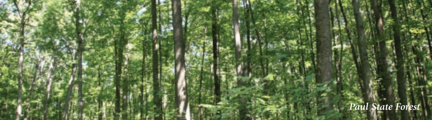
Paul State Forest