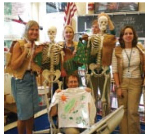
Arlington teachers use "To Be A Tree" PLT activities.