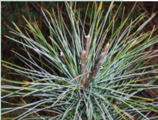
Over-abundant deer population can cause problems when deer browse on seedlings – three of the five buds eaten off the top of a small white pine seedling.

Submitted by Doug Audley, forester, Amelia County, Region 4