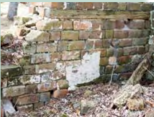
Notice the remaining part of a floor joist... this wood component had to be made from timber that was 100 to 120 years old when the house was built... and here it is still embedded in this brick wall. You can also see what is left of the cement plaster facing on the interior walls.

An interesting piece of Eastern Shore real estate, Sturgis House – named Mattissippi in colonial times – isn't faring too well. The roof is gone, and only parts of the 14-inch thick walls and chimney stacks are standing. There may not be much left, but this structure played a significant part in our history.