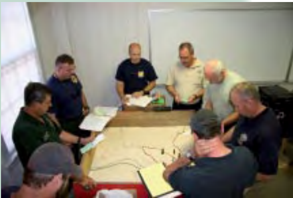
S-230 Single Resource Boss class uses a sandbox to demonstrate various firefighting scenarios.