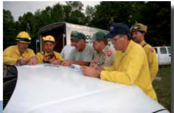
The tractor operations instructors plan the exercises for the Tractor Operations class.