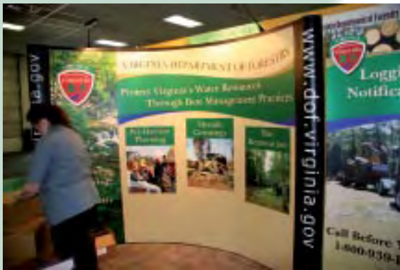
New water quality pop-up display highlighting BMPs.