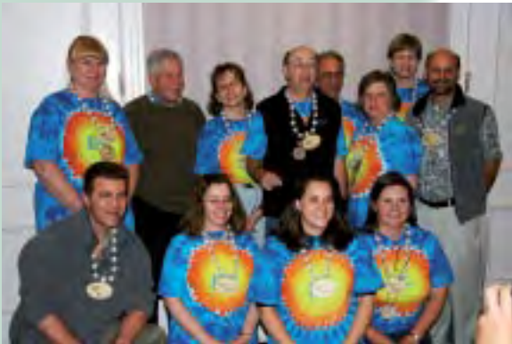
Virginia Conference Host Committee members gather for a photo.