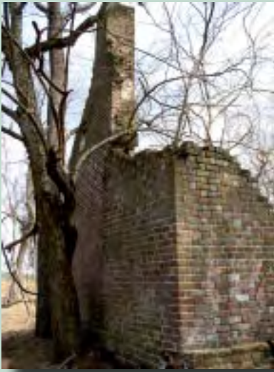
Trees are growing up around the remaining walls of the house.

Submitted by Robbie Lewis, forester, Northampton and Accomack counties