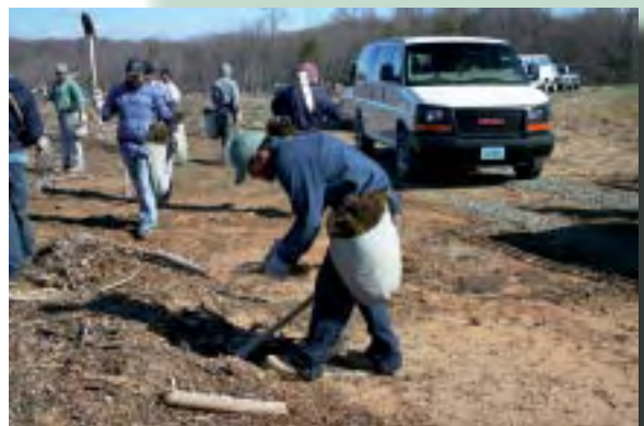
The tour group had to brave the cold in Halifax, but they were able to see a planting crew in action.

5) Partner with other agencies and groups to reach a wider audience. Don't worry about which agency "gets the credit" for a great program. Everyone wins when we work together to educate the public about the importance of forest resource management.