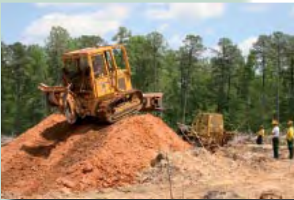
Tractor operations training gives students real hands-on experience in the seat.

The Virginia Department of Forestry is the lead agency for the Wildland Fire Academy. Several other agencies – including the USDA Forest Service; the US Fish and Wildlife Service; the Virginia Department of Fire Programs; the Virginia National Guard, and a number of others – play an important role in the success of this vital training program.