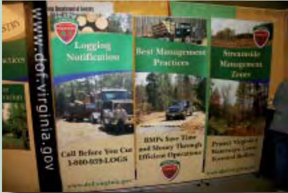
New water quality banner-up displays.