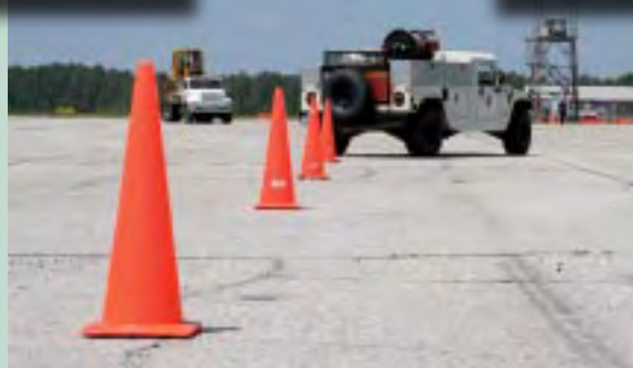
EVOC class trained students on the operation of a variety of emergency vehicles.