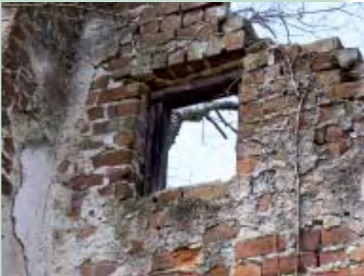
The bricks are oversized and laid in Flemish bond with headers style.