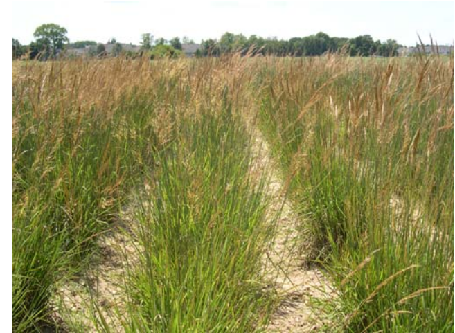
Photo of PMC Production Field

The most common cause of failure of warm-season grasses is a loose seedbed. Conventionally-tilled seedbeds should be packed before and especially after seeding. The seedbed should be firm enough to show only a light imprint when stepped on. When using a no-till drill, be sure the coulter furrows are closed to avoid seed exposure and drying. This can be accomplished by culti-packing after the drilling operation.