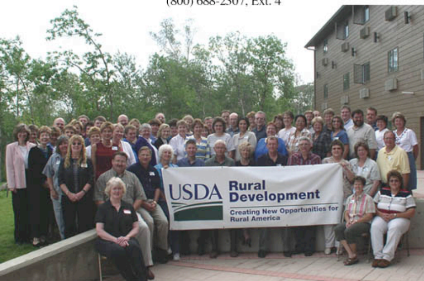
North Dakota Rural Development Team

503 Park St. West, Suite 3 Park River, ND 58270-4103 (800) 688-2307, Ext. 4