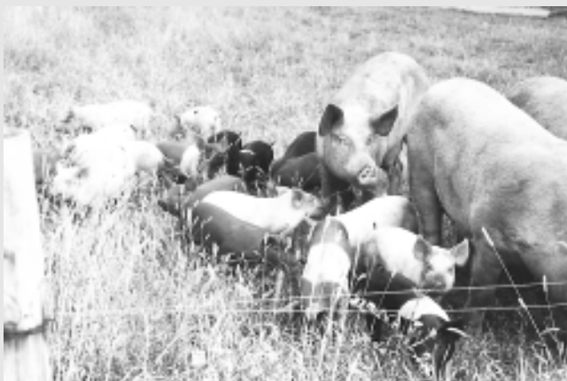
◆ Electric fencing is used to contain sows on pasture.

Overall, Tom’s rotation system has worked well for “places on the farm that are more ecologically suited for it—anywhere that we can grow a good crop.”