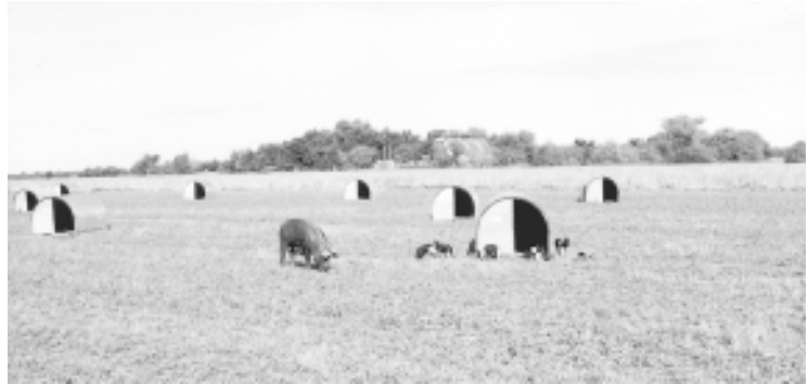
◆ In outdoor farrowing systems, portable houses are spread out over several acres.

The low fixed costs of pasture production systems, also known as outdoor or grazing systems, appeal to many farmers who want to expand their hog operations without making large capital investments. While pasture farrowing systems usually have lower weaned pig rates and poorer feed efficiency, they offer easier manure management, less odor, reduced soil erosion and water contamination (because forage crops are planted versus row crops), and better air quality. The natural environment is enjoyed by both the sows and the producers.