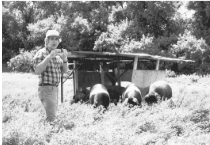
◆ Gestating sows grazing an alfalfa-brome grass pasture.

New Zealand-style fences provide a higher voltage shock for a shorter duration. This is a good deterrent and is less of a health risk to the operator and livestock. Using braided poly-stainless steel wire on spools makes it easier to install and remove fences. In most cases, pastures can be established or removed in less than an hour. These technologies give producers control over livestock without the extensive fence maintenance of older woven-wire hog fences. Since these high-voltage fences train animals quickly, only one or two wires are needed to successfully control both sows and pigs.