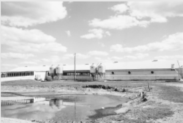
◆ Hislop Farms has a 500,000 gallon clay-lined earthen basin for manure.

Traditionally, manure from the Hislop's earthen lagoon had been pumped and hauled to the fields