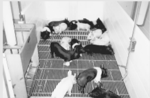
◆ 1,800 piglets are weaned every three weeks.

Before the 1998 expansion, Hislop Farms bred and farrowed 800 sows using a group system. Artificial insemination was used to breed sow groups, with a breeding window of 10 to 14 days. Hislop Farms uses PIC (Pig Improvement Company) genetics, one of the Midwest's largest swine breeders. With the completion of their fall 1998, expansion, Hislop Farms breeds a total of 1,500 sows. Using this herd size, 1,800 piglets are weaned every three weeks. The largest 1,200 pigs are moved to one