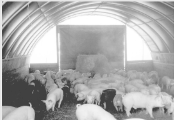
◆ Inside a properly bedded hoop structure at -25^{\circ}\text{F} , the temperature is about +30^{\circ}\text{F} at pig shoulder height.