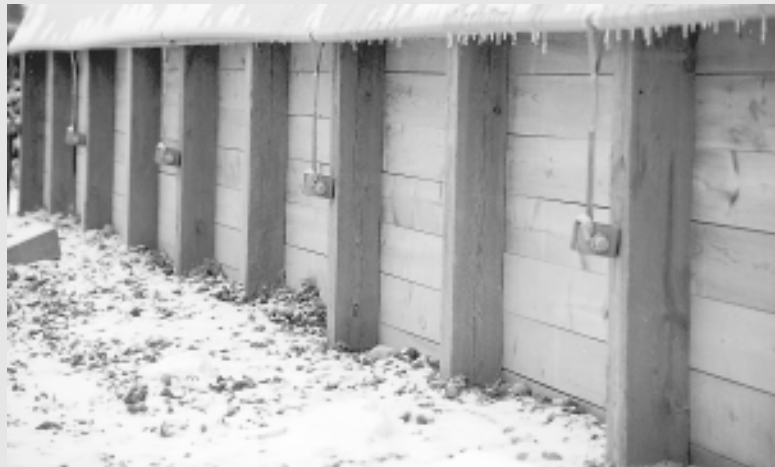
◆ Adjustable ratchet tensioners connected to a pipe allow growers to keep hoop cover tight.

years, however, Mark’s neighbors and other community members have become accepting of the hoop structure system. He’s had more than 100 farmers out to visit his farm and in 1996, Mark hosted a picnic for approximately 65 people just 10 feet from his hoop structure and composting manure packs. “You couldn’t smell a thing,” he says. “I felt like an asset to the community.”