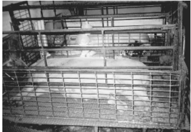
◆ Farrowing crate with sow and nursing piglet.

The need for high returns on capital investments means most confinement operations are run on a large scale and at full capacity. Operators keep buildings full by housing more hogs than alternative management systems. Depending on the facility size and farrowing schedule, confinement operations typically handle 500 or more sows and/or a minimum of 2,000 to 5,000 hogs in specialized finishing operations (Jacobson, 1998), although small- and medium-sized farrow-to-finish operations of approximately 250 sows are also common (Donham, 1998).