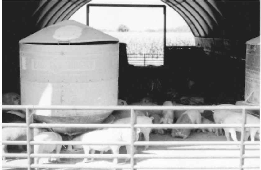
◆ A 30' x 72' hoop structure can accommodate more than 180 hogs.

Producers in Canada and the United States who want a low-cost, low-maintenance alternative to confinement structures are building hoop structures for their hog finishing and, in some cases, farrowing operations. Hoop structures are arched or curved pipes covered with a polyethylene fabric tarp. The ends of the buildings are left open most of the year, but are closed during extreme winter weather. Three-quarters of the floor is covered with deep straw bedding. The remaining portion is a raised feeding and watering platform.