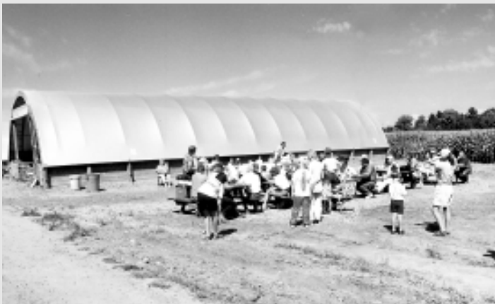
◆ In 1996 the Moultons hosted a picnic just 10 feet from their hoop structure and composting manure packs.