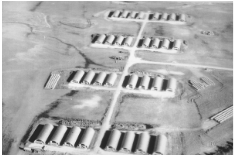
◆ Hoops can be used on any scale, from a single unit to large multi-unit facilities.

Hoop structures do not have the problems with heavy snow loads that cause failures of standard farm buildings. Snow does not accumulate as much on the structure's curved roof, and heat from the pigs and composting bedding causes snow to slide off. Also, any ice formed on the roof can be cleared from the ground level.