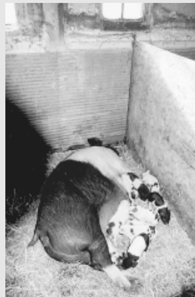
◆ Sow with pigs inside retrofitted dairy barn.

Gestating and lactating sows are divided into separate paddocks by an electric fence. Dwight beds Port-a-Huts™ with about one-fourth to one-third of a bale of straw at the beginning of the pasture season, but eventually adds up to three-fourths of a bale. "It is critical that you plan on using three-fourths of a bale of straw [per sow] in an average season," he advises. "You don't want to be stingy on straw."