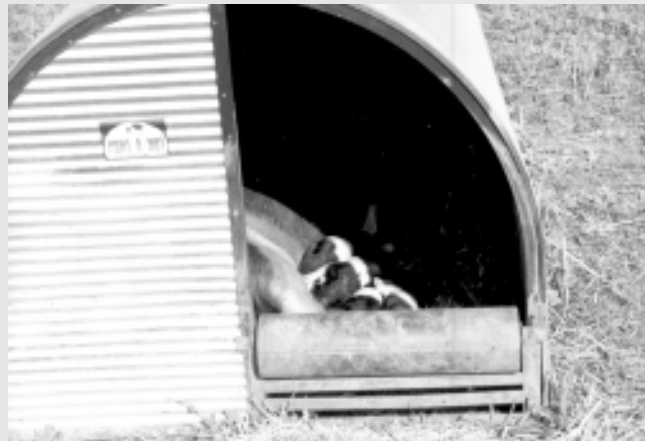
◆ Sow and litter in pasture hut.

For the March-April farrowing, Port-A-Huts™ are assembled inside the hoops. Sows choose their own Port-A-Hut™ during gestation, and Jim and his son Josh surround the huts with straw that sows can walk on before and after farrowing. Two weeks after farrowing, the huts are removed and two to three 1,800-pound round bales of straw are added to create a deep-bedded group nursery. Jim adds straw to the hoop structure as necessary until the sows are moved out on pasture, usually five to six weeks after farrowing. "At five to six weeks we open the gates," Jim says. "The sows walk out of the building directly to the pasture."