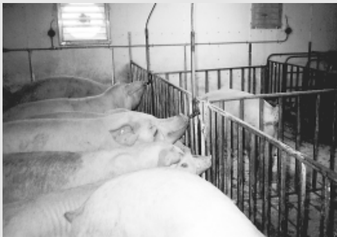
◆ Sows with ear tags.

The two adjoining barns are both conventional, fully insulated stick-built buildings. There are 24 farrowing crates in the 24- by 50-foot farrowing barn. The gestation and breeding barn is one large room with dimensions of 41 feet by 45 feet. The barns have mechanized waterers. The gestation and breeding barn has the computerized feeding system and the farrowing barn has drip coolers over each crate.