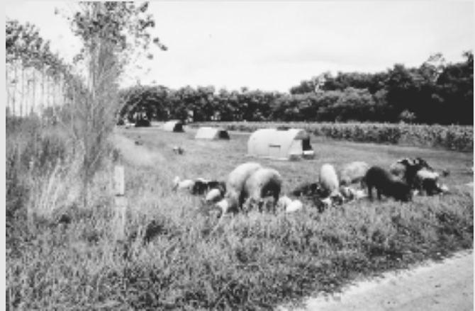
◆ Sows and litters grazing on red clover pasture between strips of corn and trees.

Two weeks before farrowing, sows are moved to a designated 15-acre area that is divided into six sets of three strips: one strip of corn, one of pasture, and a third of oats and red clover. In other words, Tom always has one strip of pasture available for farrowing, another strip of oats where young clover is developing, and a third strip with corn that is maturing for fall harvest by hogs. Pasture strips are always bordered by corn, which acts as a windbreak during cool weather and as a shade during hot temperatures. “It’s the little management practices that have been the most successful,” Tom says.