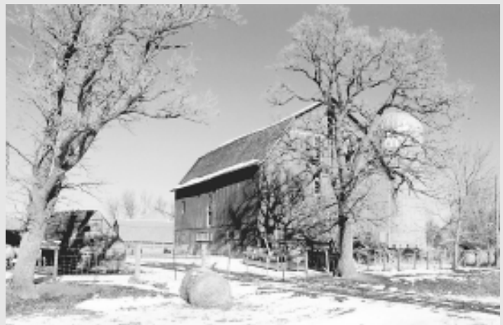
◆ Dairy barn retrofitted for Swedish-style farrowing.