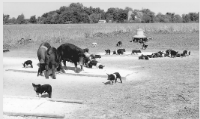
◆ Sows are fed a ration in addition to forage.