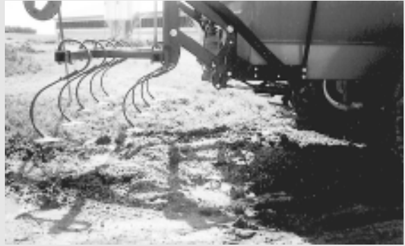
◆ Shallow injection of liquid manure.