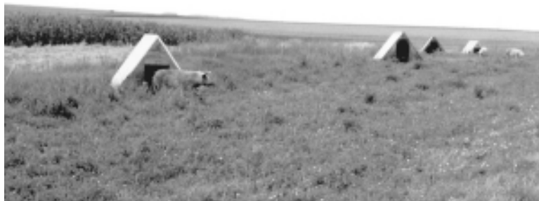
◆ Traditional A-frame farrowing huts.

Farmers looking at housing systems should think about the structure's ability to moderate temperature extremes, keep pigs dry and out of drafts, and minimize piglet crushing by the sow. How easy is it for the sow, the litter and the farmer to get in and out? Consider portability for moving, placement and storage, maintenance and repair needs, and cost (Honeyman and Weber, 1996).