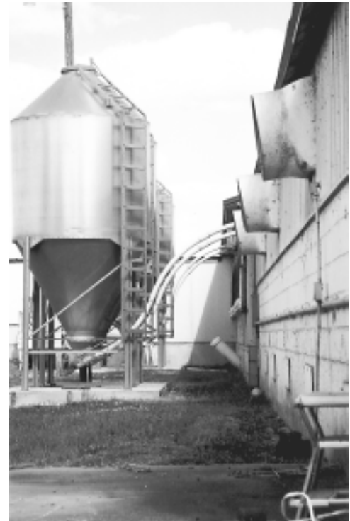
◆ Bulk feeder tanks are mounted to the outside of confinement facilities.

Elevated bulk feeder tanks are mounted to the outside of modern confinement facilities. Mechanical augers move feed from the tank indoors through ceiling pipes to feeder troughs in each pen or stall (Thu and Durrenberger, 1998). As with most Midwest non-pasture systems, confinement operations use a feeding program in which the feed ration balance is altered throughout the weaning and growth stages for maximum feed efficiency (Luce et al., 1996). A typical swine diet includes corn for an energy source and oilseed meals (mainly from soybeans) for protein. Premixed vitamin-mineral supplements, which include trace minerals, salt, calcium and phosphorus are used to supplement feed when needed. Antibiotics can also be added to the feed. Most subtherapeutic antibiotics are added during the nursery stage and into the first finishing stage to manage subclinical disease and thereby promote growth.