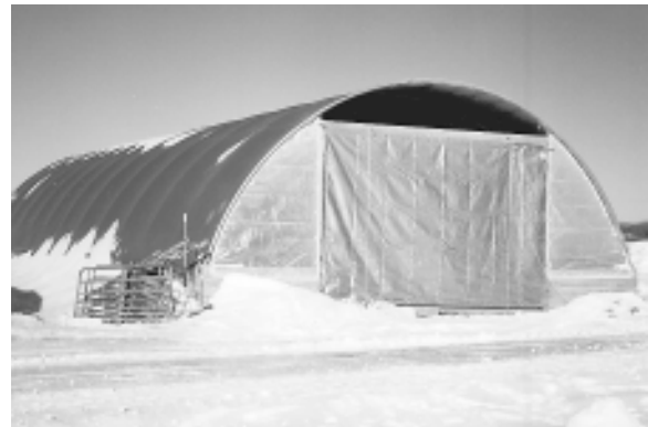
◆ Hoop structure closed up during below-zero weather.

Average daily gain for hoop-housed pigs is as good as that of confinement pigs, and may be greater (Brumm et al., 1997). Research has shown that feed efficiency drops during the winter. Because of