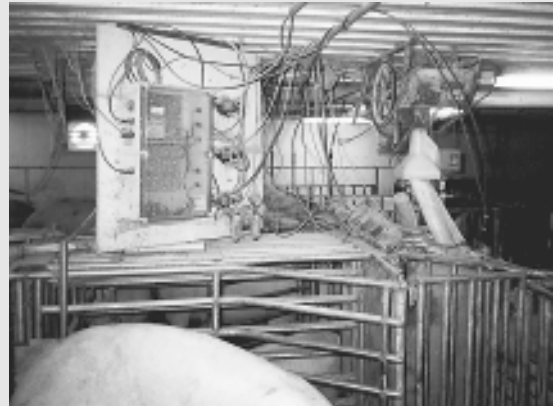
◆ Computerized feeding system insures correct amount of feed for each sow.

Currently, the sows in the farrowing barn are fed by hand. However, Larry is looking into purchasing a $150/crate automated feeding system that would be operated by the same computer that controls the automated system in the gestation and breeding barn.