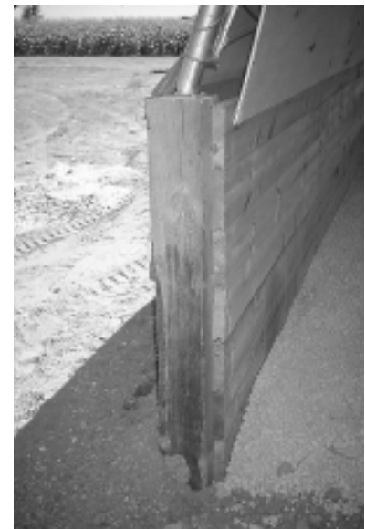
◆ Hoops are built on a lime or gravel base and sloped away from the feeding area.

Eight big round bales (approximately 1,200 pounds each) of straw or cornstalk bedding are put down and one or two 1,200-pound bales are added each week (Brumm et al., 1997). It is important to have enough bedding material and to cover wet spots. The deep straw bed provides enough heat to keep the material composting, which neutralizes pathogens, protects animal health and minimizes ammonia volatilization. The mix of straw, manure and urine composts throughout the