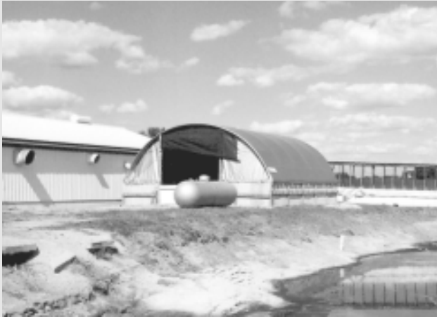
◆ Hislop Farms constructed a hoop house for composting mortalities.

unit and the smallest 600 left for another week. This allows Hislop Farms to wean more pigs of uniform age and size.