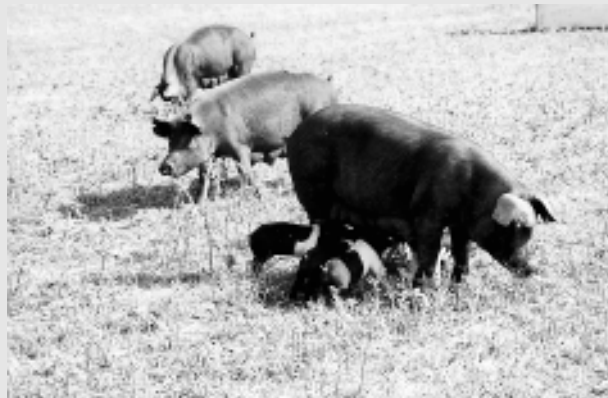
◆ A sow grazes on pasture while nursing her litter on the Ault farm near Austin, Minnesota.