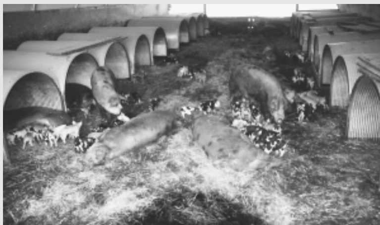
◆ Early spring farrowing with pasture huts in a hoop structure.