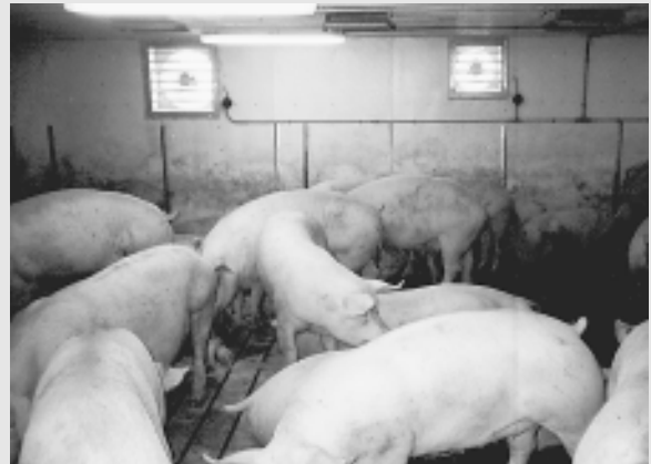
◆ Gestation and breeding area.

During humid, calm days, odor can be a problem, especially from 9 p.m. until 7 a.m. However, the cornfield seems to contain the smell to the building site and the neighbors have not complained. There are no "sensitive areas" nearby. In order to ensure that odor does not become an issue, Larry is planting a buffer line of evergreens around the barn to curb any odors that may otherwise reach his neighbors.