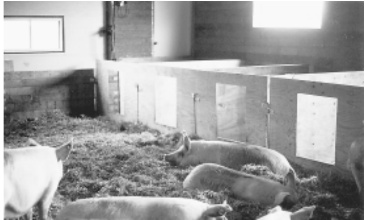
◆ Swedish type farrowing boxes. Group housing improves the well-being of the animals.

The buildings include a group nursing room in which temporary farrowing boxes measuring 6 feet by 8 feet are installed (Halverson et al., 1997). Sows build straw nests and farrow in these boxes. Group housing stimulates estrus and allows social hierarchy to develop (Honeyman and Kent, 1996). This is consistent with hogs' natural herd instincts and improves the animals' comfort and well being. Piglets are kept in the farrowing boxes for their first seven to ten days, allowing them to bond with their mother. Then the farrowing boxes are removed and the sows and litters are allowed to mingle (Halverson et al., 1997). During this period, they have free access to a common area that includes feed and water on a raised platform. After weaning, the sows are taken to a breeding barn or room while the pigs stay in the nursing room. After 11 to 12 weeks, the pigs are moved to the farm's finishing unit or sold to a finisher (Halverson et al., 1997).