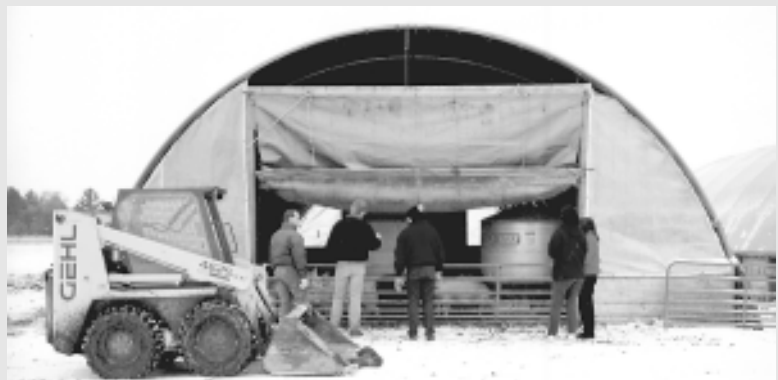
◆ A skid-steer is an essential piece of equipment for efficient manure removal in a hoop set-up.