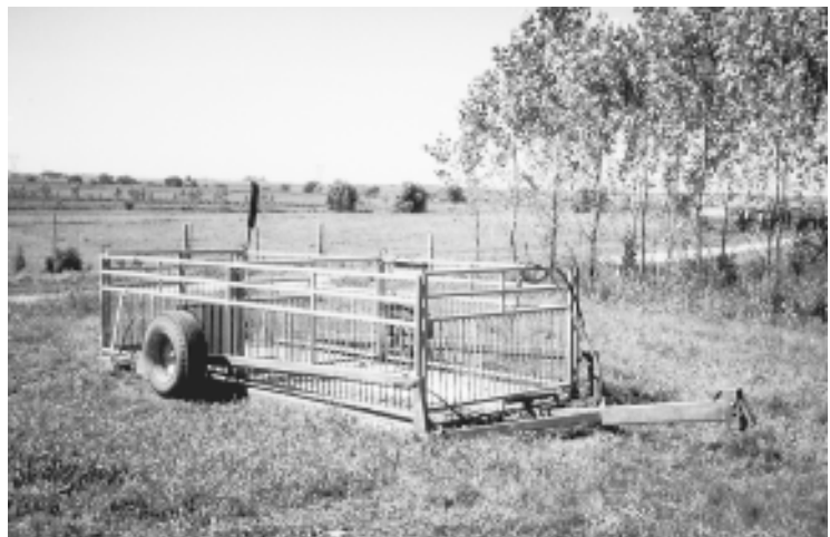
◆ A hydraulic pig mover is essential for a pasture-based pig enterprise.

Labor in pasture farrowing systems is more seasonal than in confinement systems. According to a study of Iowa farmers, farrowing is the busiest period. Labor needed during other months is considerably lower. Producers noted that even though the peak labor demand for pasture farrowing was during crop season, there was not a major conflict between the two activities. Most planting was done before the June farrowing began (Honeyman and Duffy, 1991).