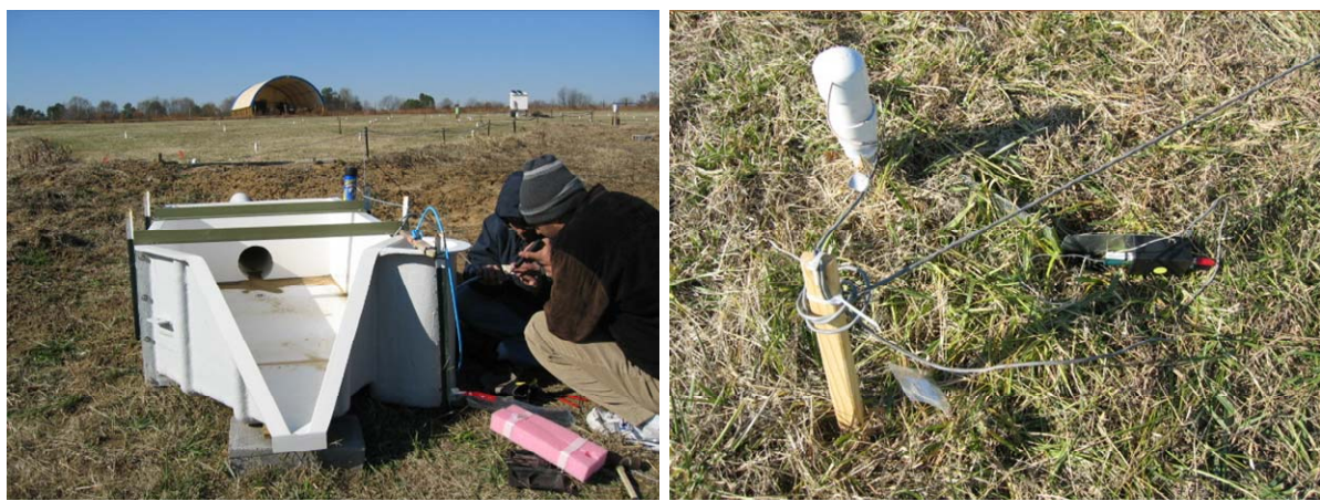
Figure 1. Instrumented hillslope with surface and subsurface sensors (detailed view on the right), H-flume, rain gage, and shallow wells at the Sand Mountain Research and Extension Center, Crossville, Dekalb County, Alabama.

of the hillslope, while the other is located near the downslope end of the hillslope. The site was instrumented such that the hillslope drains to a point where an H-flume records the overland flow from the entire instrumented hillslope. All 27 surface and subsurface sensors were installed in pair to study the interaction between the water table and overland flow for the characterization of HAAs and runoff generation mechanisms.