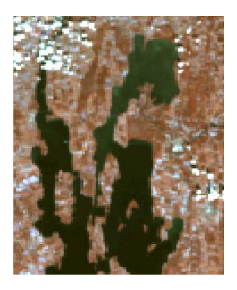
Figure 2b. ENVISAT Meris image of Mississquoi Bay and St. Albans Bay collected on September 26<sup>th</sup>, 2003.