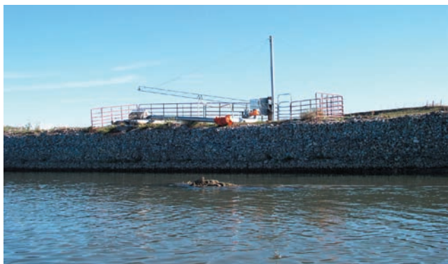
Irrigation operation on the Bear River, Cache Valley, UT.

ID - Idaho, MT - Montana, OR - Oregon, UT - Utah, WA - Washington, WY - Wyoming