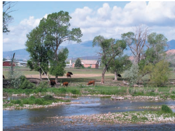
Cattle grazing on a remnant riparian area. Bear River, southeastern Idaho.

Developing buffer width guidelines based on scientific data that are responsive to regional landscape characteristics is essential to long term enhancement of water quality in the region. Buffers are particularly effective when combined with other conservation practices.