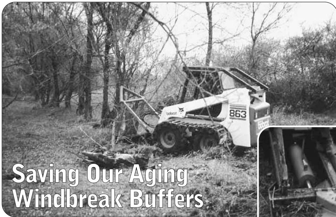
A circular saw mounted on the Bobcat results in a highly maneuverable and efficient tool for removing selected trees in the windbreak renovation project.