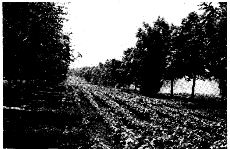
An example of an alley cropping system using eastern black walnut trees and soybeans.

It's important to remember that proper management skills are a must. If a landowner has done their homework, and is willing to work closely with a knowledgeable professional, black walnut alley cropping is a long-term investment that can't be beat!