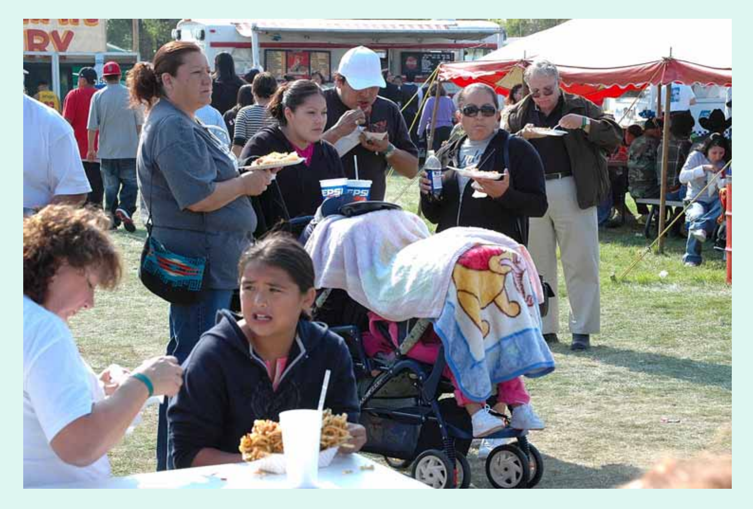
Disparities, Employment, Age and Health