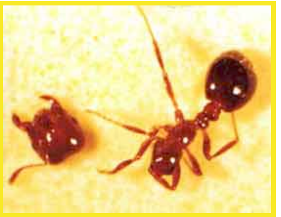
Figure 3. The phorid fly larva lives in the decapitated fire ant's head.