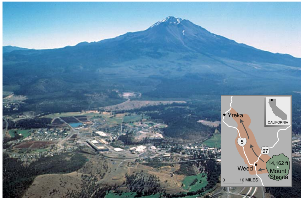
The town of Weed, California, nestled below 14,162-foot-high Mount Shasta, is built on a huge debris avalanche that roared down the slopes of this volcano about 300,000 years ago. This ancient landslide (brown on inset map; arrows indicate flow directions) traveled more than 30 miles from the volcano's peak, inundating an area of about 260 square miles. The upper part of Mount Shasta volcano (above 6,000 feet) is shown in dark green on the map.

A landslide or debris avalanche is a rapid downhill movement of rocky material, snow, and (or) ice. Volcano landslides range in size from small movements of loose debris on the surface of a volcano to massive collapses