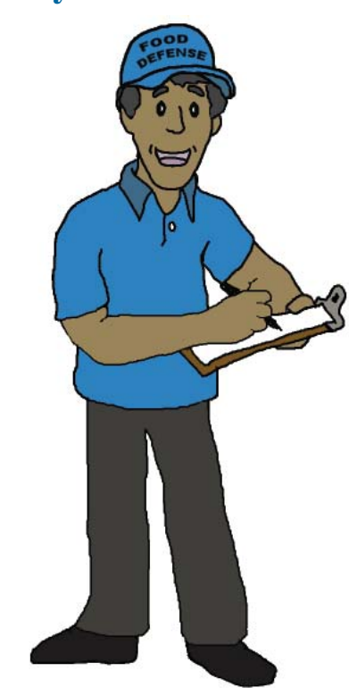
U.S. Department of Agriculture Food Safety and Inspection Service

Protect your customers, your employees, and your business.