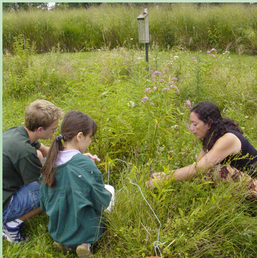
Student inquiry at PPG, Monroeville

For more information, or to register, contact WHC's Outreach & Education Department at 301-588-8994 or by e-mail at CLL@wildlifehc.org .