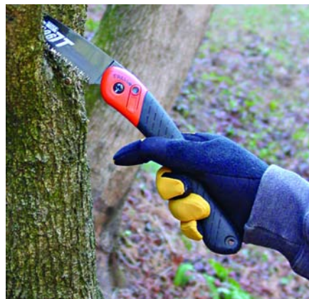
Bahco's hand saw folds for easy storage.

For hard-to-reach branches, Orchard's Edge offers several pole saws with telescoping handles that, depending on the saw, can be extended from 12 to 21 feet.