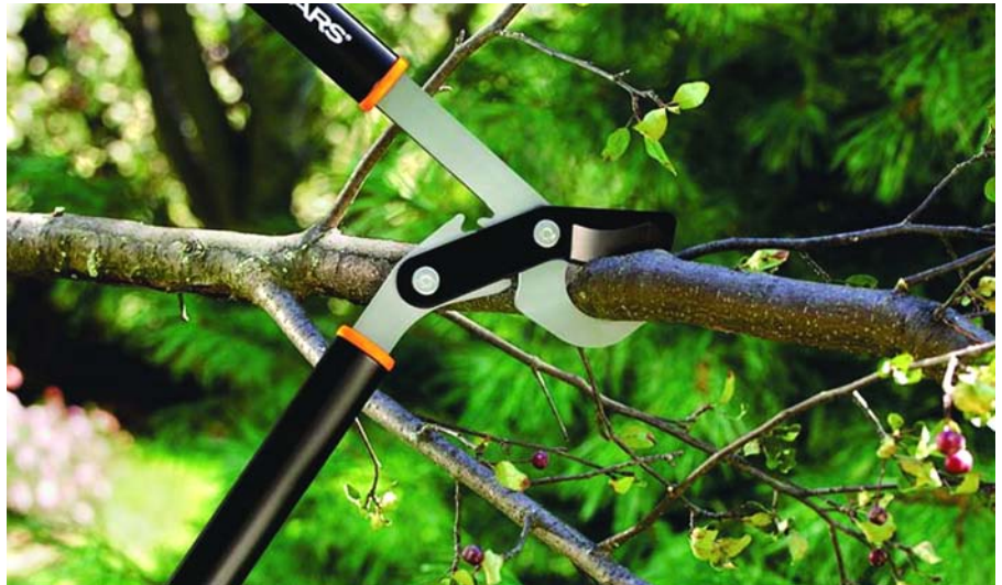
Loppers, like this one from Fiskars, are designed to cut branches up to two inches thick.

Short handled loppers—16 to 18 inches long—are great for close in work such as renewal pruning shrubs or pruning grapes. Longer handles—usually between 20 and 36 inches—extend your reach for overhead cuts or hard-to-reach spots. Some loppers have telescoping handles, which provide a range of handle lengths in a single tool. For example, the handles of Corona's Compound Action Bypass Loppers extend from 21 to 33 inches.