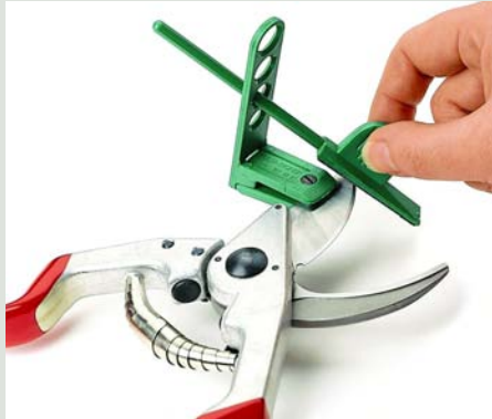
Lee Valley's sharpener for pruners