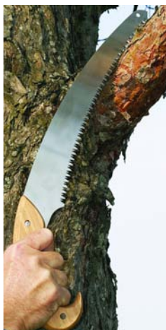
Felco curved hand saw

The blades of Bahco hand saws range from seven-and-one-half to 11 inches; some are folding and are equipped with a