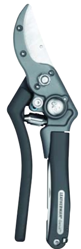
Leatherman Genus pruners and tool kit

A bit pricier than many hand pruners, the Leatherman Genus ® is actually a very compact and practical garden tool kit. If you rotate the ergonomically designed handle of the bypass pruners, you can access a knife, Phillips screwdriver, sprinkler head adjustment tool/flat screwdriver, bottle opener, and a saw. All the tools are stainless steel and the body is anodized aluminum. The tool also comes with a diamond-coated file that doubles as a handy open-end wrench for adjusting the pruner nut.