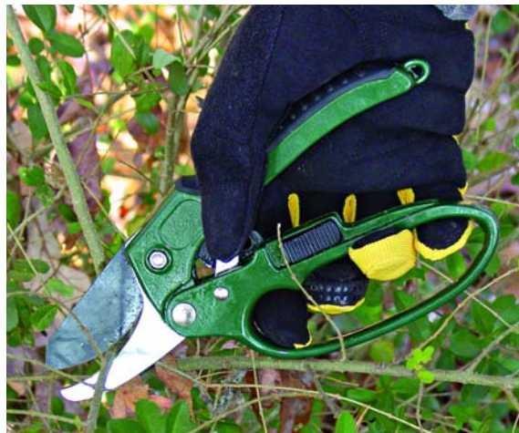
Country Home’s ratchet hand pruners

lightweight, and the handle rotates as you squeeze it, engaging gears that minimize the hand strength required. An adjustment screw allows you to modify the grip to fit your hand. Corona’s Ergo-Action bypass pruners are also designed to