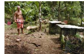
Composting bins in American Samoa

Composting and dry litter systems are being introduced throughout the islands. Farmers like their simplicity, lower water use, and the nutrient-rich fertilizer produced. Advantages and disadvantages are similar to the Portable Pens (above), except that the structures are not moved.