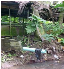
Pig effluent into a stream in American Samoa

Serious contamination of surface and groundwater with pig waste occurs throughout the American Pacific Islands. Often manures are discharged directly into the ground or streams without treatment.