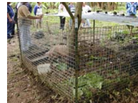
Portable Dry Litter Pen in American Samoa