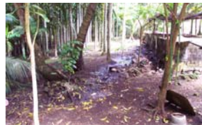
Pig manure leaching into the ground in Tinian, CNMI