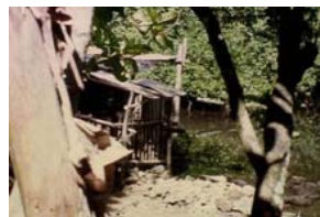
Pig pens built over a coastal mangrove lagoon in Pohnpei, FSM