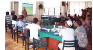
Community workshop in Rota, CNMI

Water quality education and outreach throughout the region reaches community members at universities, government agencies, youth groups, on farms and in homes to promote these practices. A recent series of workshops (July 2004) in Guam and CNMI involved over 120 participants from all over the Western Pacific to learn about improved waste management.