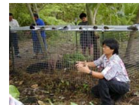
Island visits provide opportunities for knowledge exchange