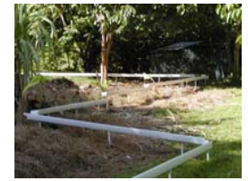
Effluent irrigation system in American Samoa