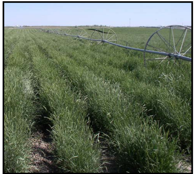
Seed Production Field of 'Vavilov II' Siberian Wheatgrass

Aberdeen PMC is pleased to announce the release of 'Vavilov II' Siberian wheatgrass. Vavilov II is a joint release with the ARS Forage and Range Laboratory, the US Army and Utah State University. Vavilov II expands the genetic base of 'Vavilov' and has better seedling establishment, vigor and forage yields. Its drought tolerance, fibrous root system, and excellent seedling vigor make Vavilov II ideal for reclamation in areas receiving 8 inches or more annual precipitation. It is intended for use on arid and semi-arid rangelands in the Intermountain West, Great Basin and Northern Great Plains. Foundation seed is available through the University of Idaho Foundation Seed Program and Utah Crop Improvement Association.