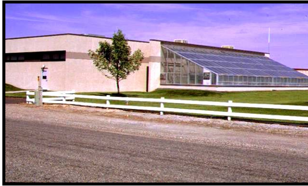
Aberdeen Plant Materials Center Office and Greenhouse

P.O. Box 296, Aberdeen, ID 83210, Tel: 208-397-4133, Fax: 208-397-3104, Web site: Plant-Materials.nrcs.usda.gov