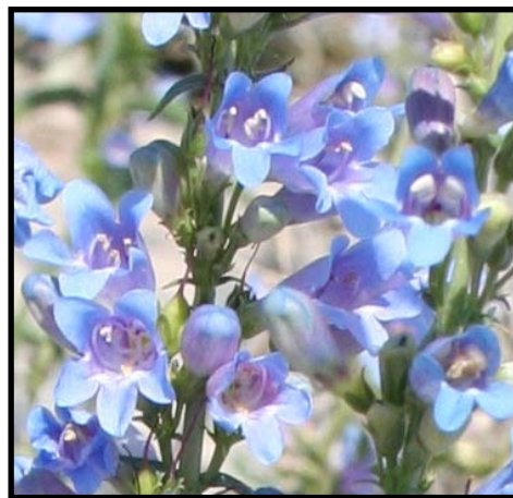
Royal Penstemon Grown for Seed Increase

The native forbs were seeded into weed barrier fabric in the fall of 2005 and observations are being made on plant establishment and growth. Seed was harvested from the penstemon and buckwheat plots in 2007 and 2008. The first harvest of nine-leaf biscuitroot occurred in 2008.