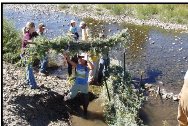
Students install a brush spur on the Scott River near Etna, CA as part of a Streambank Soil Bioengineering workshop

As part of our technology transfer efforts, we teach a 3 day workshop on streambank soil bioengineering treatments. This includes classroom training and actual field training where the students install a number of bioengineering treatments on an actively eroding bank.