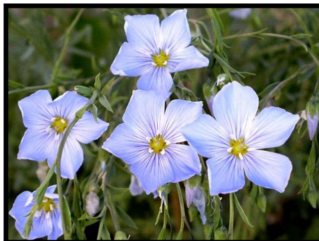
Maple Grove Selection Lewis flax

'Appar' blue flax was released in 1980 and has been widely recommended as a component of seed mixtures to provide diversity and beauty. It was originally identified as a native species to North America but was later determined to be introduced from Europe. Maple Grove, originally collected in central Utah shows great promise as a native replacement for Appar.