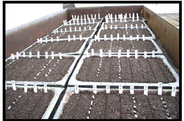
Outdoor Natural Stratification Trial

Greenhouse and field trials are scheduled for 2005 to evaluate the possibilities of using direct seeding methods to establish wetland plant species. New seeding technologies have been developed in the private sector which may be applicable to our western wetland planting needs. These trials will compare planting methods (drilling, broadcasting, tackifiers and pelleted seeds) as well as time of seeding.