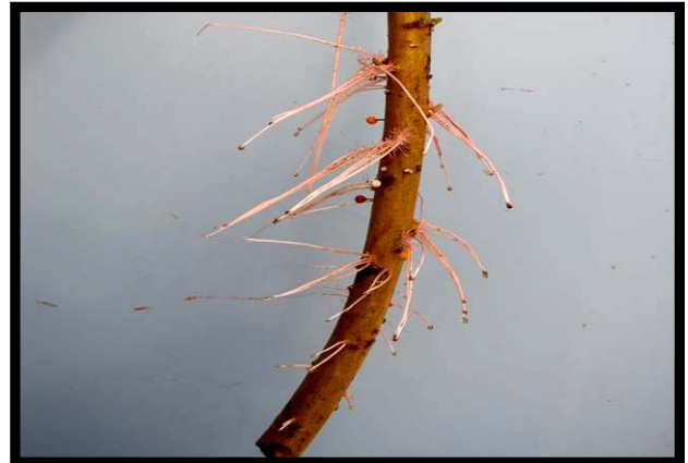
Peachleaf Willow after 13 days of soaking.

Research is underway at the PMC to evaluate the effectiveness of pre-soaking willow and cottonwood cuttings prior to planting. Greenhouse tests conducted in 2004 evaluated various soaking depths and temperatures and their affects on root formation. Future tests are scheduled for 2005 to evaluate establishment success using different pre-soaking treatments.