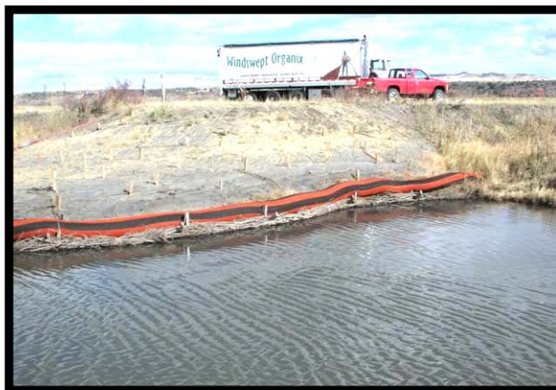
Testing a new organic soil-filled sack for a fascine on the Little Colorado River, AZ

This year, Streambank Soil Bioengineering Technical Training workshops were held in Springerville, AZ and Grand Forks, ND.