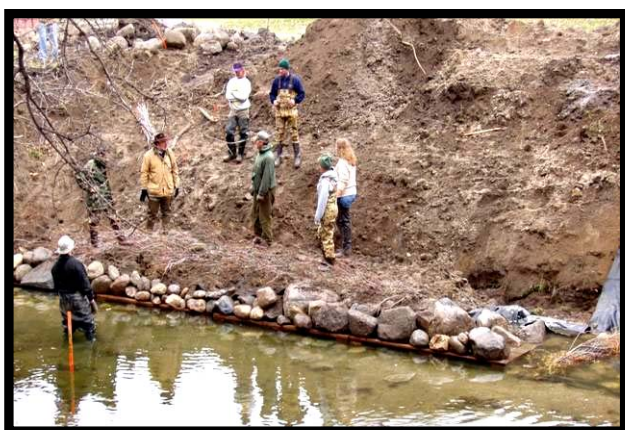
Turtle River Demo Project, Grand Forks, ND

As part of our technology transfer program, a three-day Streambank Soil Bioengineering Technical Training Workshop was developed. This workshop was formally a two day workshop, but based on popular demand, has been expanded to a three day course. The first day and a half of the workshop is devoted to the classroom where basic riparian dynamics, riparian zone vegetation, plant acquisition, bioengineering techniques, woody plant propagation, case studies, and project planning are discussed. The afternoon of the second day is held in the field discussing a proposed restoration site. The participants utilize the knowledge gained in the classroom to develop restoration plan alternatives. The plan alternatives are then discussed and the selected plan for the project site is discussed with the group. The third day is spent at the project site where participants install a series of bioengineering treatments on an eroding section of streambank based on the selected project plan.