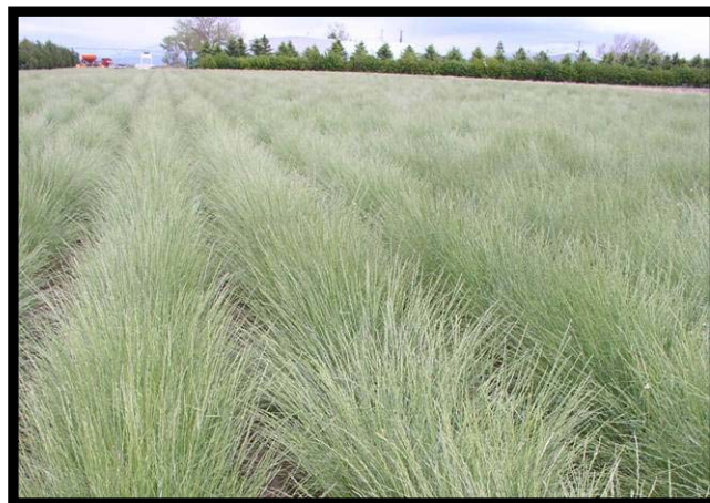
Anatone bluebunch wheatgrass seed production field

Through cooperation with the Forest Service, Shrub Sciences Laboratory and the Bureau of Land Management the PMC has released Anatone bluebunch wheatgrass and Maple Grove Lewis flax. Anatone was originally collected by the Shrub Sciences Laboratory and appears to have better seedling vigor than 'Goldar' which was released by the PMC in 1989. Anatone appears to be better suited to drier conditions than Goldar which typically needs at least 12 inches of annual precipitation to establish.