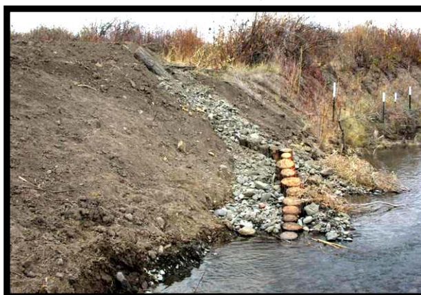
Post Vane (barb using posts instead of rock) tested on the Little Colorado River, AZ