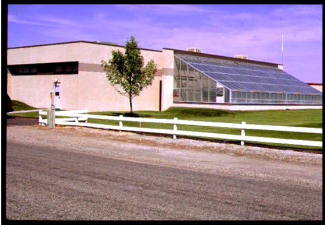
Aberdeen Plant Materials Center office and greenhouse

P.O. Box 296, Aberdeen, ID 83210, Tel: 208-397-4133, Fax: 208-397-3104, Web site: Plant-Materials.nrcs.usda.gov