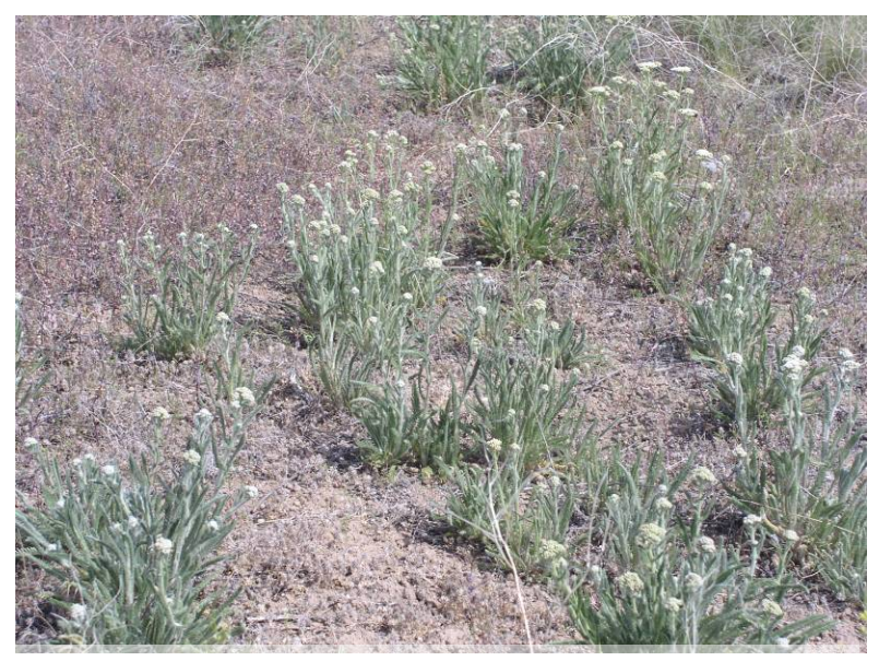
Stand of Eagle yarrow, May 2007.

Despite some good stands in 2005, all of the forb and shrub accessions except for Eagle yarrow had zero plants during the 2006 evaluation. Eagle had 0.07 plants/ft<sup>2</sup> in the frequency grids along with a small stand of plants at one end of the seeded plot. In 2007 more plants of Eagle had either germinated from the original seeding, or seed had spread from established plants. Plant density for Eagle in 2007 equaled 0.24 plants/ft<sup>2</sup>. Snake River Plains fourwing saltbush also had a single plant found in the plots, increasing its density from 0.00 to 0.02 plants/ft<sup>2</sup>.