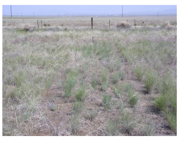
Jim Creek bluebunch wheatgrass, 2007.

The bluebunch wheatgrass accessions had the highest average densities of all the native grasses. All decreased slightly in density from 2005 to 2006, but still maintained good stands. P-12, Wahluke and Jim Creek all had densities over 1.00 plants/ft<sup>2</sup>. Columbia, Anatone, P-7 and P-15 had densities between 0.50 and 1.00 plants/ft<sup>2</sup> while P-5 and Goldar both shared low densities. In 2007 densities were generally slightly lower, but still higher than all other species as a whole. The highest density recorded in 2007 was Jim Creek at 1.07 plants/ft<sup>2</sup>.