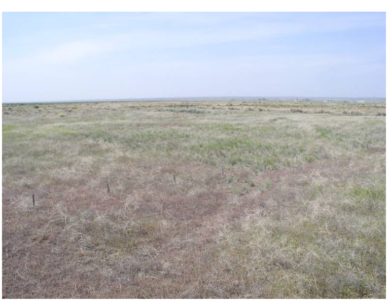
Orchard test site on May 16, 2007.

The Orchard Display Nursery was planted on November 16, 2004 in cooperation with the Great Basin Native Plant Selection and Increase Project. The nursery includes 82 accessions of 27 native and introduced grass, forb and shrub species. Each accession was planted in 7 X 60 foot plots. See Tilley et al (2005) for descriptions of the species and accessions planted. The remaining area was planted to a cover crop mix of 50% Anatone bluebunch wheatgrass, 20% Bannock thickspike wheatgrass, 20% Magnar basin wildrye and 10% Snake River Plains fourwing