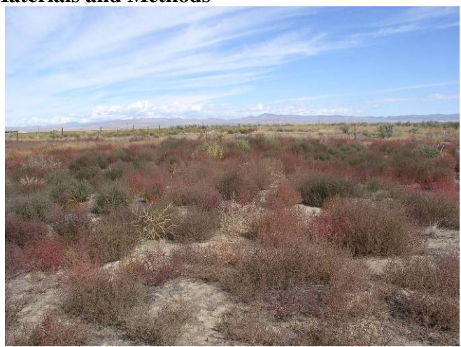
Orchard display site in September 2004 prior to final mechanical seedbed preparation

The Bureau of Land Management (BLM) burned the site in the fall of 2002. The site was later sprayed by PMC staff in May 2003 and May 2004 with a Roundup/2, 4-D herbicide mix to create a weed free seedbed. Due to limited breakdown of dead grass clumps that would inhibit proper seed placement with a drill and to ensure a clean seedbed, the decision was made to cultivate the site with a cultipacker just prior to seeding. During the first evaluation most plots contained high numbers of Russian thistle (Salsola sp.) and moderate amounts of bur buttercup (Ranunculus testiculatus Crantz) plants. Russian thistle plants were approximately