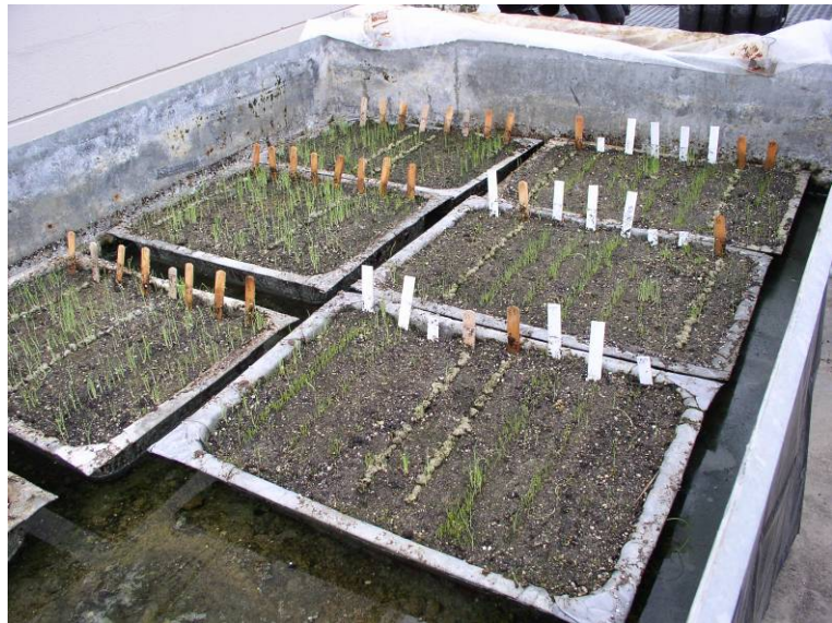
Figure 3. Artificial wetland tank with greenhouse flats.

Rows were evaluated on 5 May 2005 (15 days after planting) for number of seeds germinated directly within the rows. Plants between rows were considered to be from displaced seeds and were not counted. Carex rows were evaluated for the number of plants for the entire 31 cm (12 in) of row, while Juncus rows were only evaluated in the middle 10 cm (4 in) because of the large number of seedlings in the Juncus rows. Percentage germination was determined by dividing the number of seedlings found by the estimated number of seeds placed in the rows ( Carex ) or row segment ( Juncus ). Data were then subjected to a single factor analysis of variance (ANOVA) and means separated using the Tukey test with a significance level of 0.05 (Zar 1999).