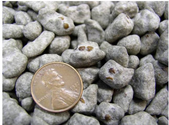
Figure 1. Submerseed™ particles incorporated with alkali bulrush seeds.

New technologies have been developed that may be adapted to the problems faced in direct seeding wetlands. Tackifiers commonly used for hydro-seeding are available to glue seed to the soil. Another product, Submerseed™ from Aquablok Industries (Toledo, Ohio), involves binding seed with clay or clay-sized material and organic polymers to a dense aggregate core (Figure 1). These aggregates absorb water and sink, preventing seeds from floating to the surface (Krauss 2004; Submerseed 2005). In preliminary testing using these products, our results showed excellent germination rates without seed loss due to washout (Figure 2).