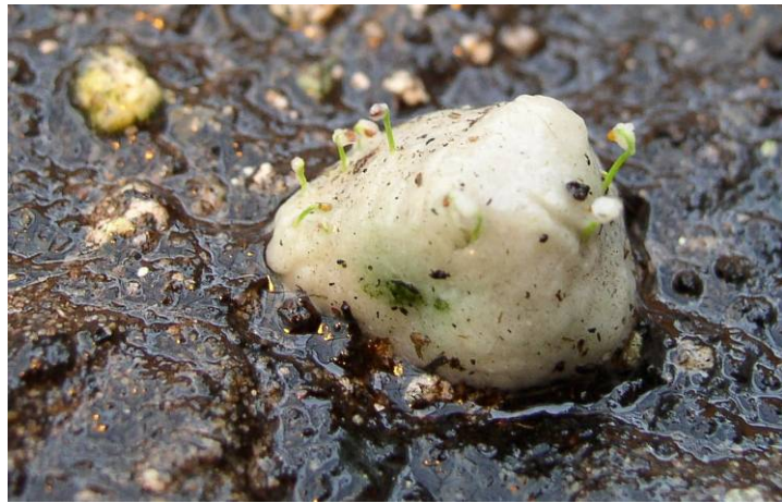
Figure 2. Submerseed™ particle with Juncus seedlings (six days after planting).

The experiment was conducted at the USDA Natural Resources Conservation Service Plant Materials Center in Aberdeen, Idaho. Seed of Nebraska sedge ( Carex nebrascensis Dewey [Cyperaceae]) and Baltic rush ( Juncus balticus Willd. [Juncaceae]) (Table 1) were planted on 20 April 2005 into 56 cm x 41 cm (22 in x 16 in) greenhouse trays filled with a 1:1:1 (v:v:v) mix of peat, perlite and sand. Rows were created using an imprinting jig designed to make eight, 31 cm (12 in) rows, 6 mm (0.25 in) wide and 6 mm (0.25 in) deep. Treatments were placed