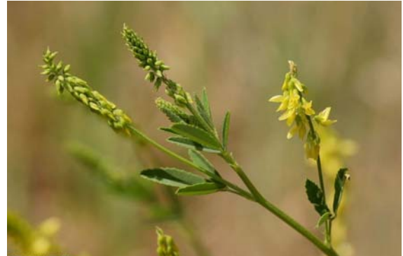
Sweetclover flower.