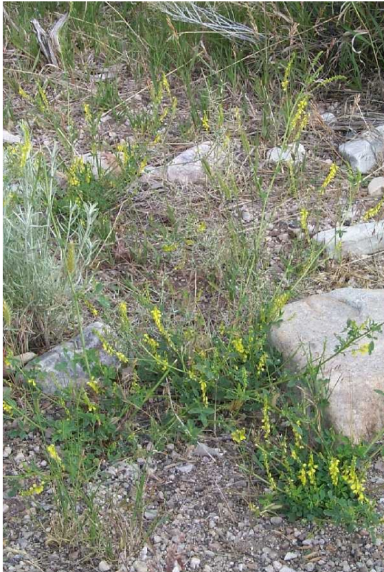
Yellow sweetclover.

Contributed by: Idaho NRCS State Office and Aberdeen, ID Plant Materials Center