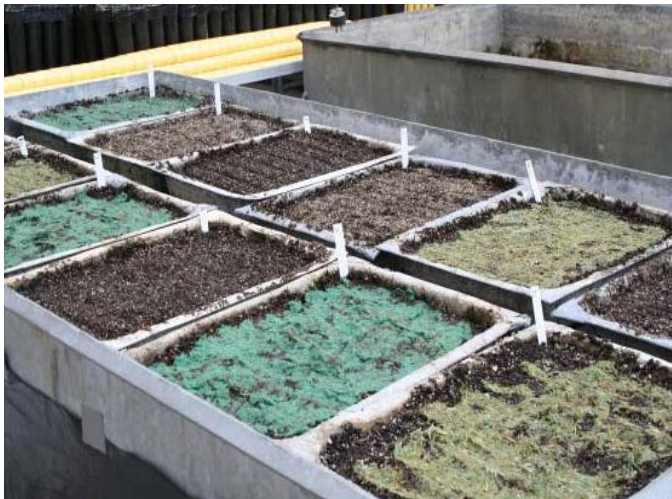
Figure 1. Treatments in greenhouse trays prior to flooding.

Three replications of each treatment were seeded in 12" X 18" (1.5 ft 2 ) greenhouse trays placed randomly in a 4' X 8' X 1' artificial wetland tank in the PMC greenhouse. Mulch was applied at the recommended rate of 2000 lb/ac or 31.5g/tray (McClure, 2006). Tackifier was applied in all wet treatments at 5X the recommended rate (0.25g/tray) which equates to 16.25 lb/ac. The seed used for this trial was Sterling Selection of Baltic rush with a PLS of 89.1%. To more easily handle the very small amount of seed necessary, it was decided to use a very high seeding rate of 500 PLS/ft 2 (0.055g/tray). Hydroseeding applications were simulated by mixing seed, water, mulch and tackifier into a 2 liter kitchen measuring pitcher. The slurry was mixed and agitated for several minutes allowing tackifier crystals to dissolve and a uniform suspension to be made. The hydroseed slurry was then poured over the soil as evenly as possible. Any large clumps of mulch were smoothed out with a spoon. Hydroseed treatments were applied on April 17 and allowed to dry overnight to allow the tackifier to set (figure 1). Soil in each tray was a 1:1:1 mixture of peat, sand and perlite.