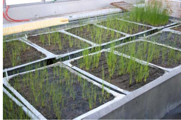
Figure 2. Juncus seedlings after 21 days.

At the time of the first flooding event, there seemed to be a lot of seed washing out from the dry broadcast treatments, significantly more than from Fertil-Fibers and tackifier treatments. This was confirmed in the plant density evaluation (table 1). Fertil-Fibers had an average plant density of 300 plants/ft 2 , and the tackifier treatment averaged just over 200 plants/ft 2 , 2 to 4 times more germinants than the next highest density, the straw mulch treatment. Straw and wood mulch appeared to be too thick and may have been covering Juncus seeds