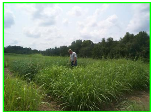
Highlander eastern gamagrass produced over 8 tons/acre and removed 184 and 121 lb/acre N and P 2 O 5 at Holly Springs, MS. Other top performing grasses were 'Sumrall 007' bermudagrass and 'Alamo' switchgrass.

The PMC long-range program identified a need for plant materials for nutrient management. For the past three years, the PMC and the MAFES at Holly Springs have been evaluating the yield and nutrient (N and P) uptake of warm-season grasses fertilized with poultry litter. One application of litter was broadcast applied in late April based on the N requirement of the grass for maximum yield (4 to 6 tons/acre depending on grass specie). Grasses are harvested using best management practices for forage production. Total N and P uptake in the top growth are determined using yield and nutrient concentrations measured in the plant tissue. Agriculture Research Service will be working with the PMC and MAFES personnel to monitor nutrient movement below each grass plot.