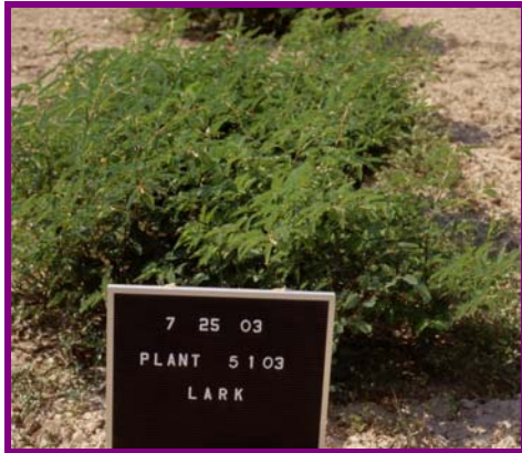
Lark plot in inter-center strain trial

In addition to developing warm-season native grasses that are considered critical for improving wildlife habitat, the PMC is also actively selecting plants for wildlife food and habitat (643, 645).