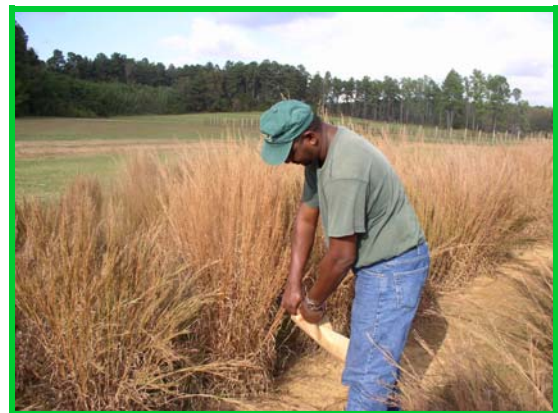
Collecting seed of little bluestem at the PMC

Early germinating seeds of little bluestem and purpletop from the mother plant nursery, established at the PMC 2002, were used to establish a new nursery block in 2003. Germination tests confirm that significant progress has been made to increase early germination in these populations. We plan to advance these lines for additional testing.