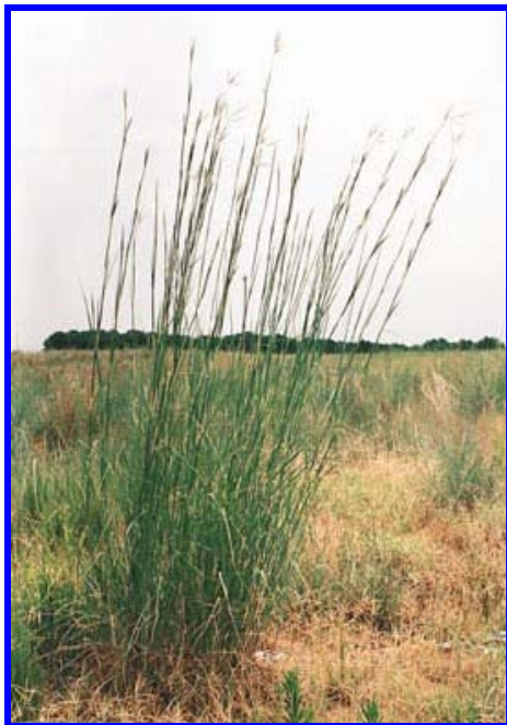
A clump of big bluestem in flower

MSU is concentrating on developing cultivars of big bluestem, Indiangrass and a tall, high-yielding switchgrass for bioenergy production. The PMC is addressing the other species listed, as well as attempting to develop a shorter switchgrass cultivar for forage and conservation use.