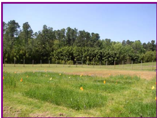
Little barley cover crop plot (foreground)

Cover crops (340, 327) can prevent soil erosion on cropland during the winter months, but are not widely used in the mid-South due to the annual costs of re-planting. Little barley ( Hordeum pusillum ) is a native, cool-season grass that can form dense natural stands in some crop fields. NRCS agronomists in Mississippi and North Carolina have expressed an interest in either utilizing these natural stands as cover crops for cotton or developing seed sources that could be planted for this purpose. Assuming that burndown for cotton planting would take place on April 15, the naturally early-flowering little barley could possibly produce enough viable seed to maintain stands without replanting, which would increase its usefulness.