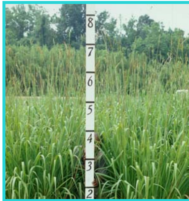
Highlander eastern gamagrass

Seventeen years ago, the PMC began working to develop a cultivar of eastern gamagrass ( Tripsacum dactyloides ) that is well adapted for forage (512) and erosion control (327) in the Southeast. This year, we successfully completed this mission by releasing 'Highlander'. It was released with the cooperation of the Mississippi Agricultural and Forestry Experiment Station (MAFES) and the Jimmy Carter PMC in Americus, Georgia.