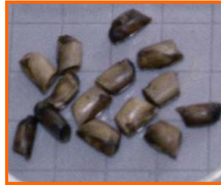
Stratified Highlander seeds

commercial producers produce high quality seed, we will be applying for Plant Variety Protection. Data collection for this application began in 2003 and the application will be submitted in 2004 when data collection is completed.