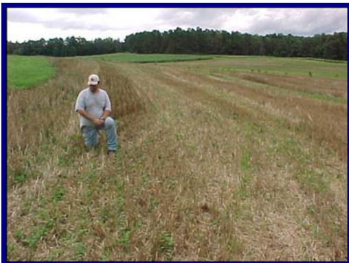
Soybeans emerging in wheat stubble

Two-year-old pecan seedlings planted in January 2003 survived and grew well. Wire cages placed around each tree proved to be an effective method for protecting the seedlings from deer damage. A five-wire, electric fence was installed around the field in October.