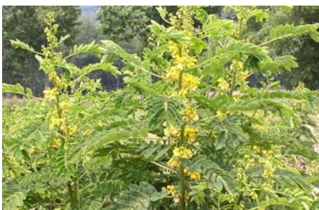
Senna hebecarpa , American senna