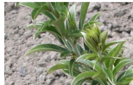
Lespedeza capitata , roundhead lespedeza