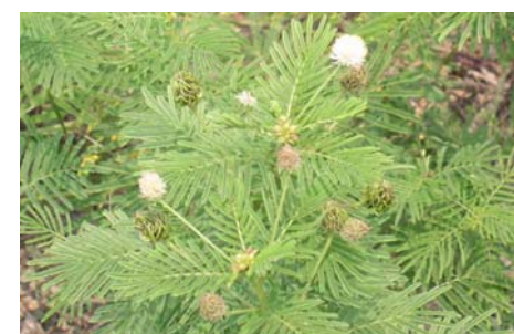
Desmanthus illinoensis , Illinois bundleflower