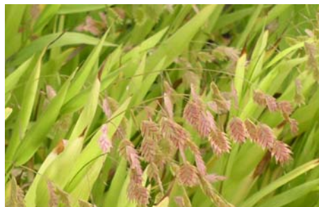
Chasmanthium latifolium , Indian wood oats