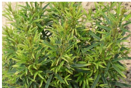
Lespedeza virginica , Slender lespedeza