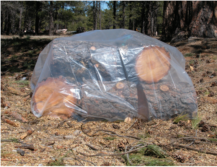
Figure 2. Firewood covered with plastic.

height or thickness of the pile. This technique is usually only effective during the hottest months of the year, April through September. The high temperatures produced will kill bark beetles inside the wood. Mortality of bark beetles in the logs at the top of the pile may exceed fifty percent, but those in lower logs may not be affected.