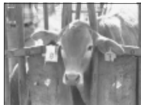
The eartag in this animal’s left ear contains the electric device that emits the audible signal.

The technology has been licensed to an electronics firm, which is continuing the development of this research. Testing is underway to evaluate the effect of this technology on livestock—information essential to ranchers and farmers before they use such devices. A field study is planned for fall 2000 to determine the effectiveness of the device and its effect on livestock