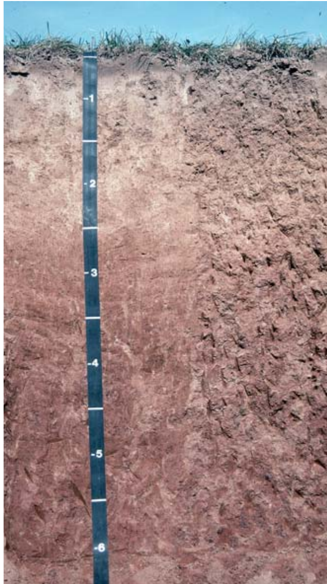
Figure 5.—Profile of a Crider soil.

clay films on faces of peds; few prominent black (10YR 2/1) iron and manganese stains on faces of peds; few fine irregular black (10YR 2/1) iron and manganese concretions throughout; 3 percent chert gravel; strongly acid; clear wavy boundary. 3Bt8—76 to 80 inches; strong brown (7.5YR 5/6) clay; moderate very fine and fine angular blocky structure; firm; many prominent yellowish red (5YR 4/6) and few prominent strong brown (7.5YR 4/6) clay films on faces of peds; common prominent black (10YR 2/1) iron and manganese stains on faces of peds; common fine irregular black (10YR 2/1) iron and manganese concretions throughout; 3 percent chert gravel; strongly acid.