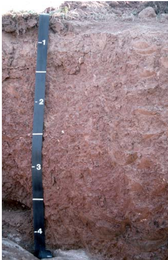
Figure 6.—Profile of a Haggatt soil.