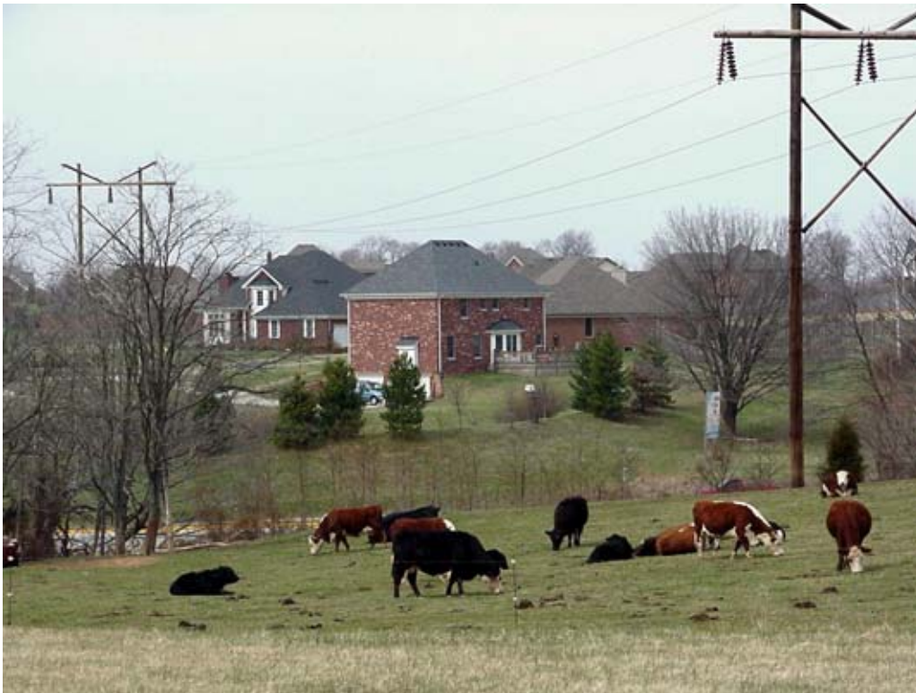
Figure 2.—Urban sprawl into an area that has historically been a farming community is an example of land use changes in the county.

The highest elevation in the county, about 1,006 feet above sea level, is in Franklin Township on Hickman Hill. The lowest is about 382 feet above sea level in an area along the Ohio River where it leaves Floyd County. The entire county is drained by the Ohio River and its tributaries. The main streams that drain into the Ohio River are