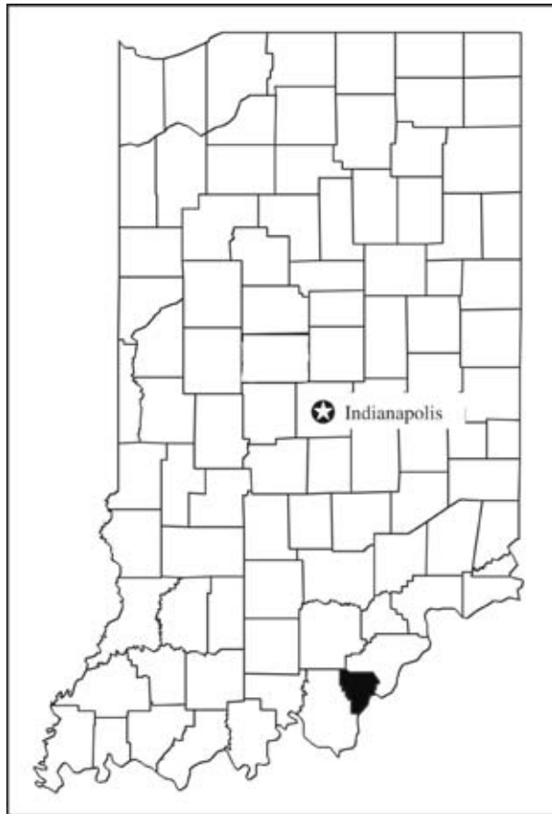
Figure 1.—Location of Floyd County in Indiana.