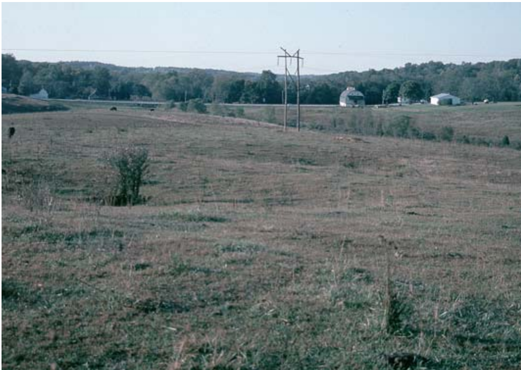
Figure 9.—A typical karst landscape in Floyd County. Pictured are Caneyville, Haggatt, and Knobcreek soils.

From about 150,000 to 130,000 years ago, Indiana was invaded by the Illinoian continental ice sheet, which covered much of the eastern part of Floyd County. The ice sheet deposited a thin layer of till. The thickness of the till was only a few feet in most places but ranged to as much as 30 feet. The till is discontinuous and is absent on the steeper hillslopes where post-glacial sheetwash and gully erosion have removed the weak unconsolidated materials.