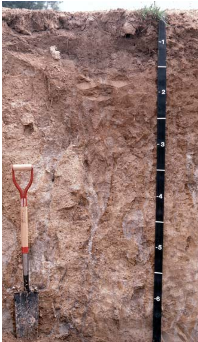
Figure 8.—Profile of a Spickert soil (terrace phase).

clay depletions on faces of peds; 2 percent channers; brittle; very strongly acid; gradual wavy boundary.