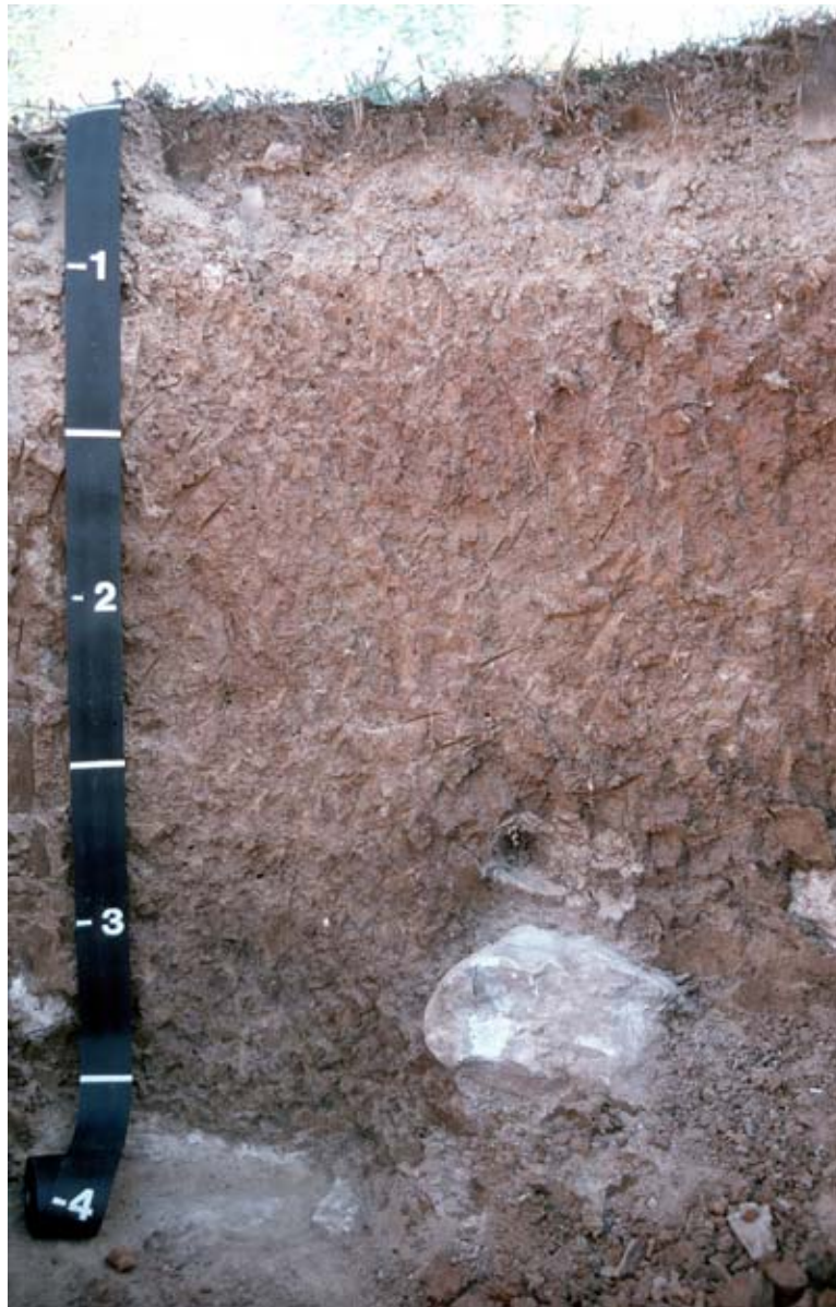
Figure 4.—Profile of a Caneyville soil.

Reaction—very strongly acid to neutral Content of rock fragments—0 to 5 percent chert gravel