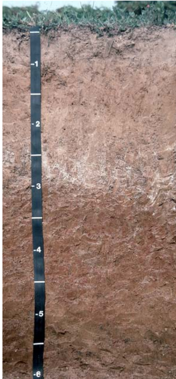
Figure 7.—Profile of a Navilleton soil.

2Bt6—54 to 61 inches; yellowish red (5YR 4/6) clay; moderate very fine angular blocky structure; firm; many distinct yellowish red (5YR 4/6) clay films on faces of peds; common fine and medium rounded black (10YR 2/1) iron and manganese concretions throughout; 3 percent angular chert gravel; neutral; clear wavy boundary.