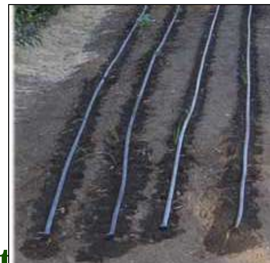
Wetting pattern of drip tape