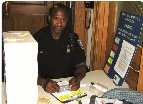
An armed guard awaits those who approach the lockup area, keeping the area secure.

While their work begins before lockup actually starts, WAOB puts the details together behind the same closed doors. NASS and WAOB share the lockup space; however, they are on sep-