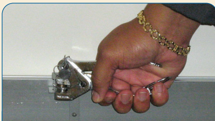
Each window shade in lockup is closed and secured with a wire and lead clasp to prevent cell phone or wireless signals from being sent.

The data for cotton acreage was to be released at noon Eastern time. At that time, markets suspended trading for an hour, starting at noon,