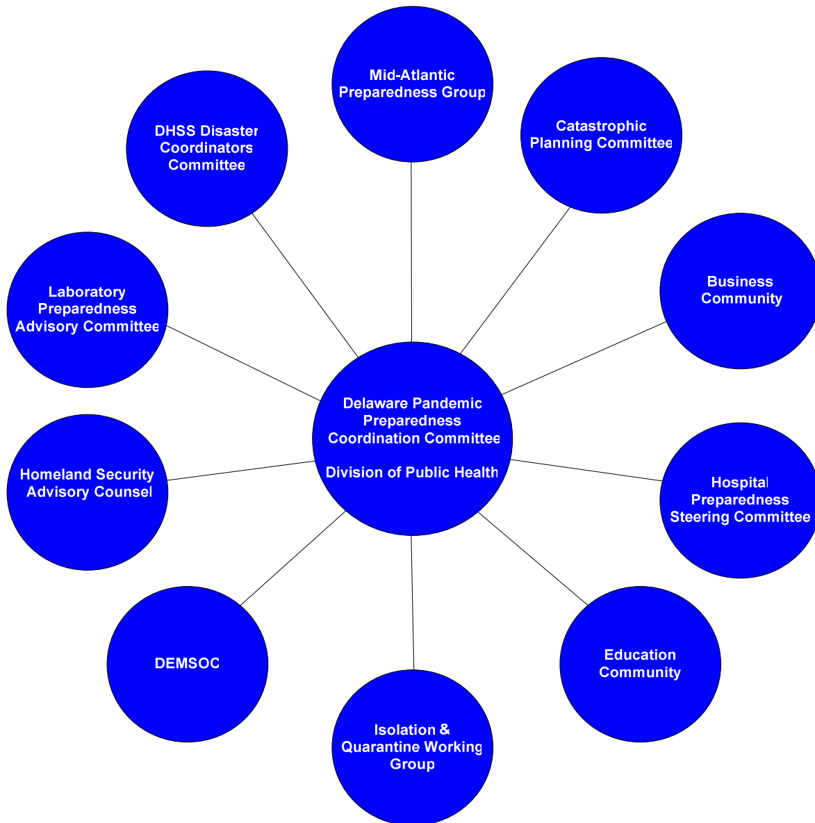
Figure 1 Delaware Pandemic Preparedness Coordination Committee