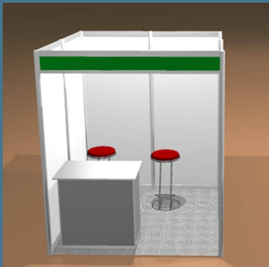
2m x 2m Booth

The booth rental includes two access badges to the exhibit area. Software/database demonstrators who wish to attend the technical sessions must register for the Conference, but they will be eligible for a 25% reduction on the conference fees of two registrants associated with the organization renting the booth.