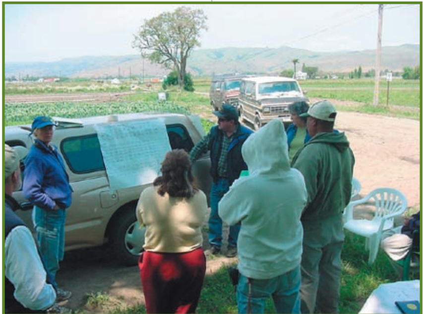
Regular staff meetings with employees provide a place to discuss production tasks, personnel conflicts, and safety concerns.