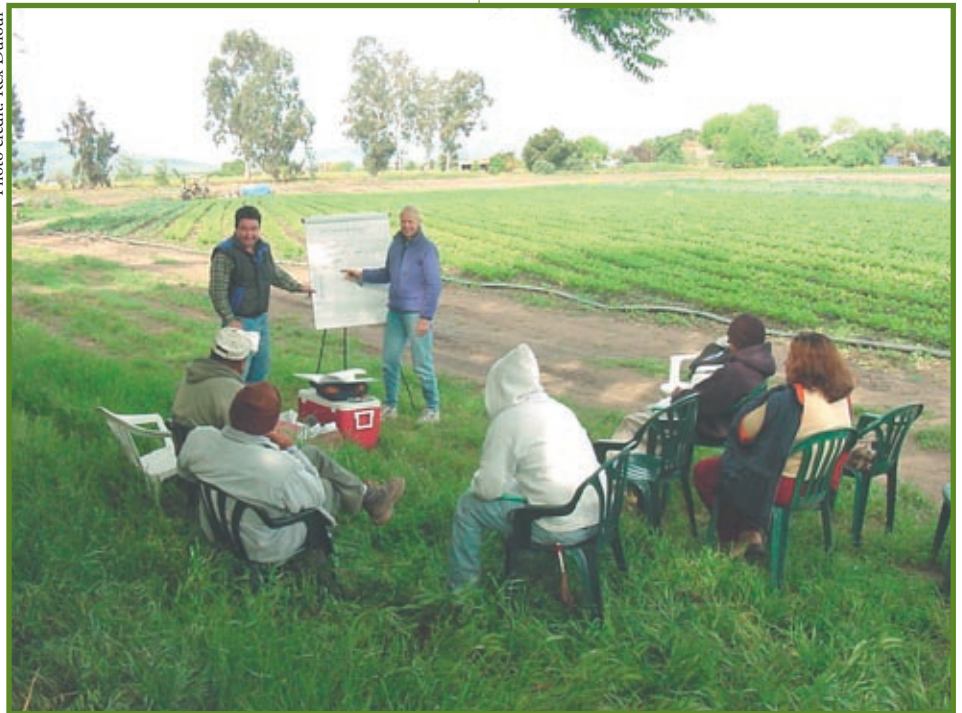
On-farm educational sessions can help employees understand how businesses operate or they can address some other common interest.