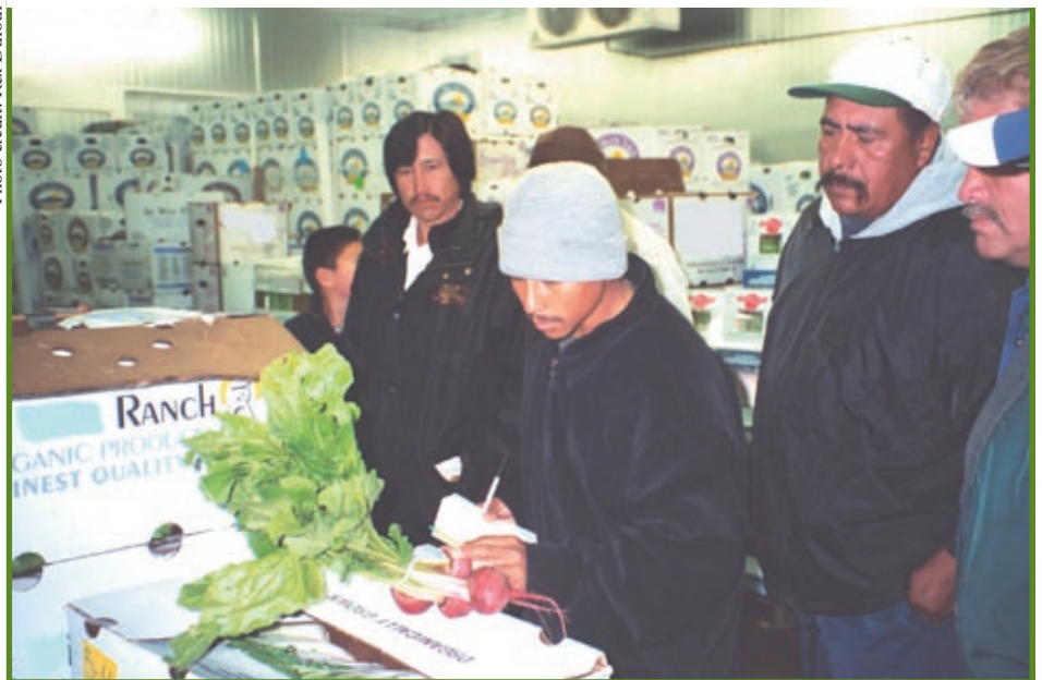
Employees can teach each other how the business works. In the process, everyone learns leadership, responsibility and cooperation.