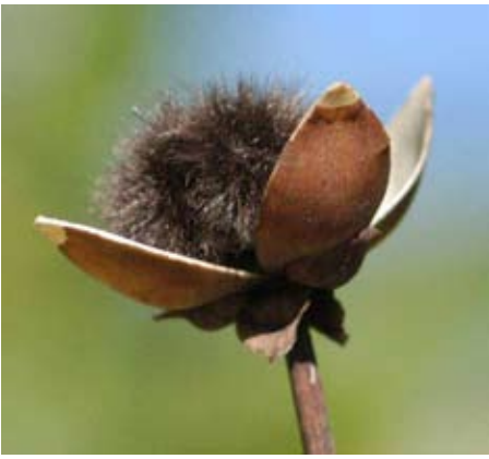
Ipomoea carnea ssp. fistulosa (bush morning-glory).