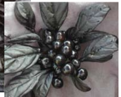
New ornamental pepper cultivar 'Black Pearl'.

Seed of 'Black Pearl' is available only from the Pan American Seed Company, 622 Town Road, West Chicago, Illinois 60185, and through many seed catalogs.