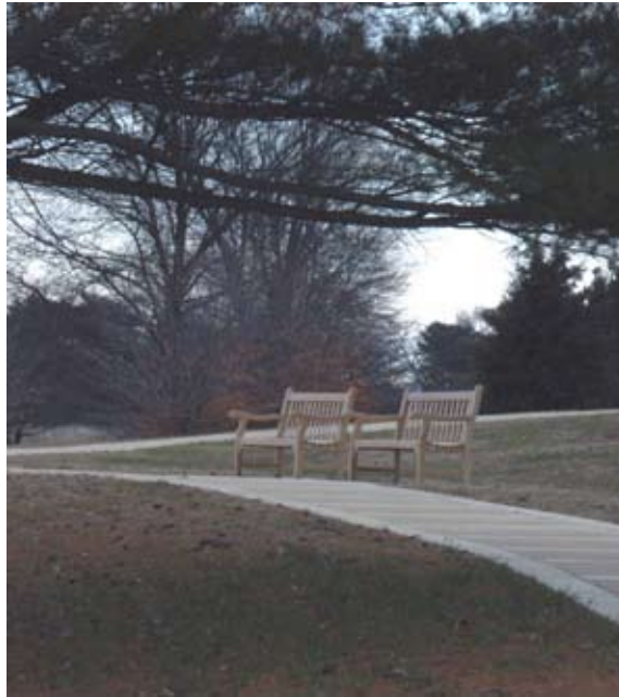
New benches installed along the Flowering Tree Walk.

With the construction phase of the Flowering Tree Walk completed, planting along the broad new pedestrian path may now begin. Some trees will go in this winter if weather allows, but most of the trees will be planted in Spring of 2006. The design is ready for the initial planting along most of the walkway and for the bio-retention ponds located in the meadow and adjacent to the handicapped-accessible parking lot. Efforts are underway to obtain quality specimens of the specified trees. New benches installed along the path offer comfortable resting places. The Flowering Tree Walk provides an important handicapped accessible link between key collections and other attractions at the arboretum.