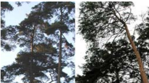
Fig. 1. Morphological characters of Pinus sylvestris var. sylvestriiformis trees resembling Pinus densiflora var. densiflora (A), and Pinus sylvestris var. sylvestris (B).