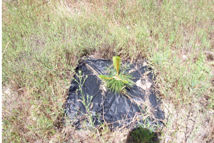
Figure 4-6: Ponderosa pine with vispor matting around base to suppress weed growth.

Once planted, excess soil is placed around the plant to help collect and retain water. Mulch and/or geotextile fabric can be placed around the tree to inhibit weed growth, retain water and help protect against frost.