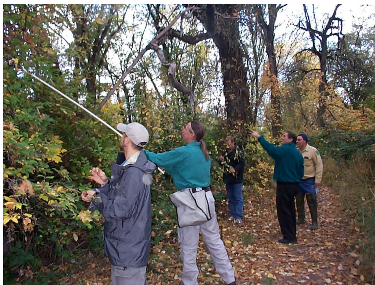
Figure 4-1: Native Seed Collection workshop, November, 2003.

Species native to the local riparian site are most appropriate for planting in the riparian area. Local biotypes have better vigor and hardiness, are better able to compete with nonnative vegetation, and attract local native wildlife (Carey, 2003). Native plant seeds were collected during the fall 2003 workshop and propagated at the Bureau of Land Management Sprague Seed Orchard, which will be used in fall 2004 plantings. Additional seed collection workshops will be held to collect seeds from several different parent plants to provide genetic diversity and be used in future plantings and replantings. Other plant stock will be obtained from local native nurseries, the Bureau of Land Management and J. Herbert Stone Nursery.