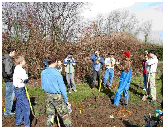
Figure 4-7: Riparian Planting techniques workshop, March 2004.

Workshops are a vital component of the riparian planting program. Workshops covering native seed collection focus on seed collection methods, what species to collect, when and where to collect seeds, and germination and viability of native seeds, with emphasis on the value and importance of native seed sources. Seeds collected are used for future plantings. The riparian planting technique workshop focus on planning and implementing riparian planting projects, including equipment use and supplies needed, site planning, selection of plant stock, seasonal considerations in planting, and planting methods.