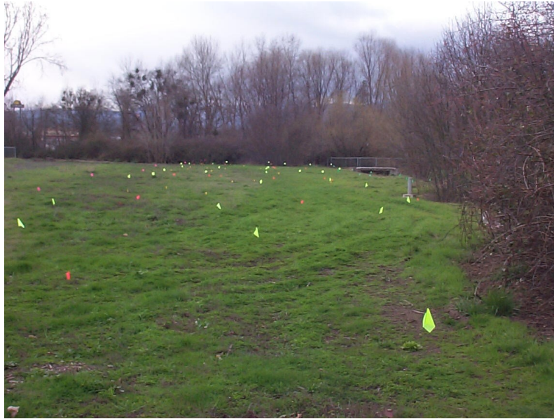
Figure 4-3: Site flagged prior to planting event.

Prior to planting, the site is flagged, color coded for plant species, to assure plants are located according to the site prescription. The planting location is prepared by first removing all vegetation within a 3' diameter of where the tree is placed.