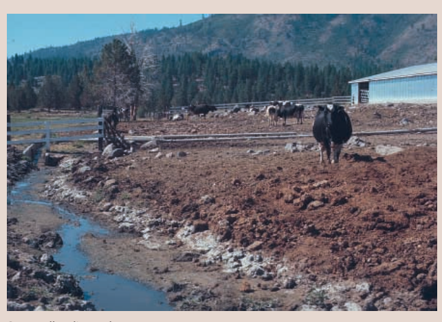
Do not allow livestock to enter streams.