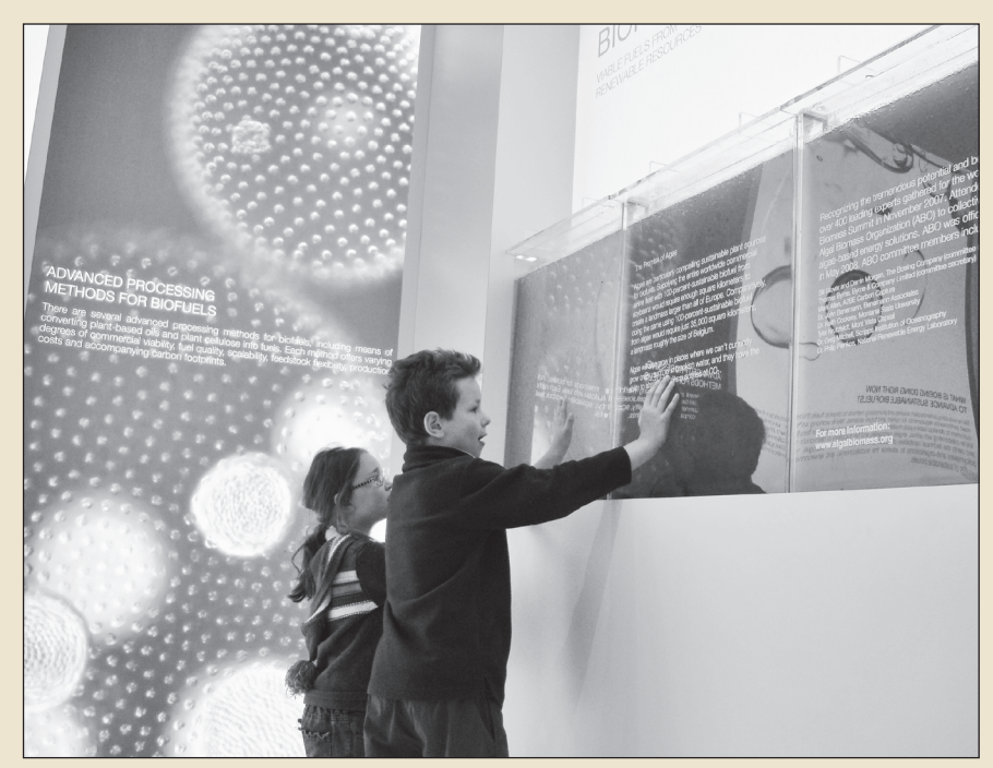
A young girl and and a young boy stop to study information about the algae tanks at the Farnborough International Air Show, which took place in London July 14-20.