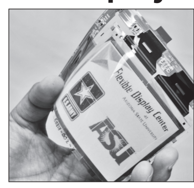
Researchers at ASU's Flexible Display Center have developed a new process for manufacturing high-performance flexible displays on transparent plastic.