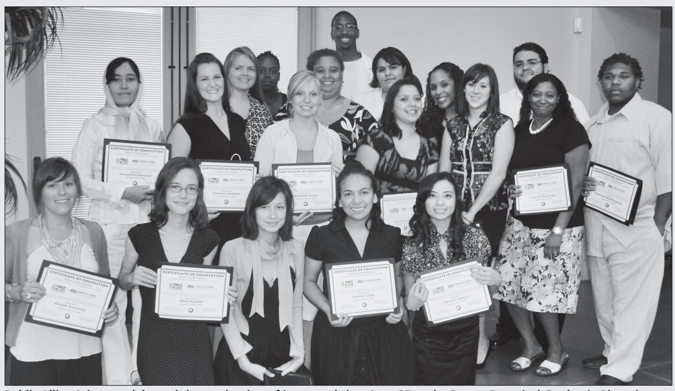
Public Allies Arizona celebrated the graduation of its second class June 25 at the Desert Botanical Garden in Phoenix.

Kurth, with the Biodesign Institute, can be reached at (480) 727-9386 or julie.kurth@asu.edu.